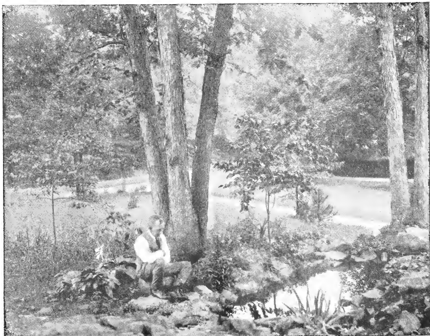
A GLIMPSE OF THE POOL IN A SUMMIT ROCK GARDEN LAID OUT BY US.

We buy only from the best sources, and our aim is to supply only the highest quality of everything we sell.