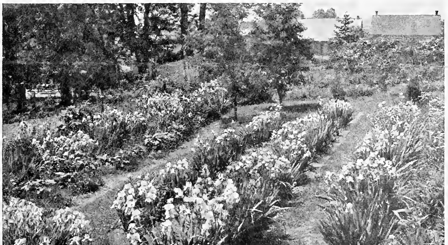
This Iris garden is the pride of Miss Florence Beck, Camp Hill, Pa.

Collection A—Twenty-five separate varieties, packed and correctly labeled, will be sent for $5; Collection A2—fifty separate varieties for $10. This is at the rate of 20 cents each, but all of these bulbs are considerably more valuable.