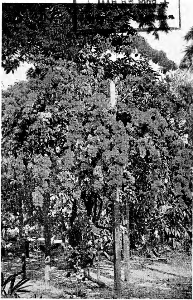
BOUGAINVILLEA CRIMSON LAKE