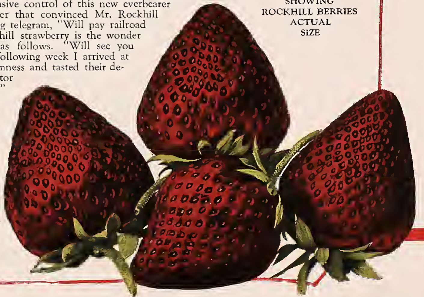
SHOWING ROCKHILL BERRIES ACTUAL SIZE