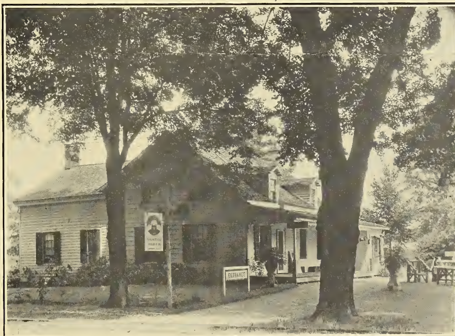
The Home of "The Economizer;" our Headquarters on the South Road, Poughkeepsie.

The policy for which this publication stands is the best guarantee obtainable with nursery stock. We offer no other. "THE ECONOMIZER" is not going to be a market cryer. It is to be an expert agency. Nursery stock sells itself. This paper is not a sales-getter. It is aimed at a "distribution" of trees and plants that will be advantageous both to the public and to us.