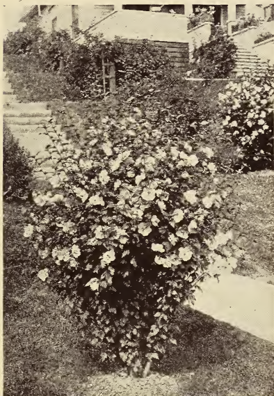
Althaea, or Rose of Sharon

ALMOND , Flowering. A bushy shrub, or dwarf tree rarely over 5 feet tall, bearing rose- and blush-colored double flowers in early spring. Hardy and very attractive. Heavy plants. $1.00 each.