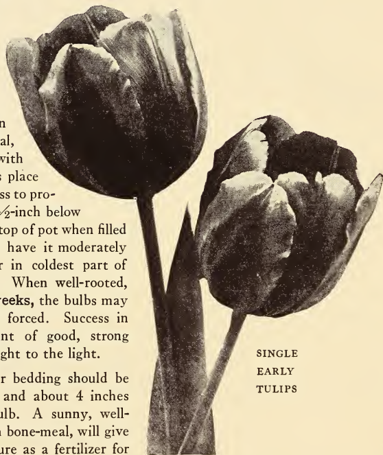
SINGLE EARLY TULIPS

Single Early Tulips continued on page seven