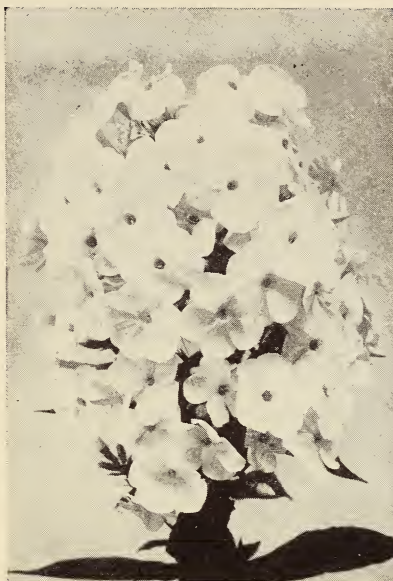
Phlox, Miss Lingard

COREOPSIS lanceolata grandiflora. Beautiful hardy border plant, 15 to 18 inches high. Bright golden yellow flowers throughout the entire season. 25 cts. each, $2.50 per doz.