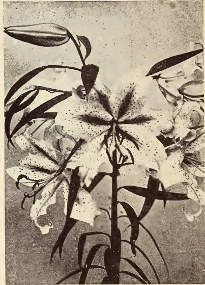
Golden-rayed Lily of Japan

Lilium auratum. Golden rayed Lily of Japan. Monstrous white flowers thickly studded with crimson spots, each petal marked with wide golden band. Very beautiful and showy. Large sized bulbs, 25 cts. each, $2.50 per doz.; extra-size bulbs, 40 cts. each, $4.00 per doz.