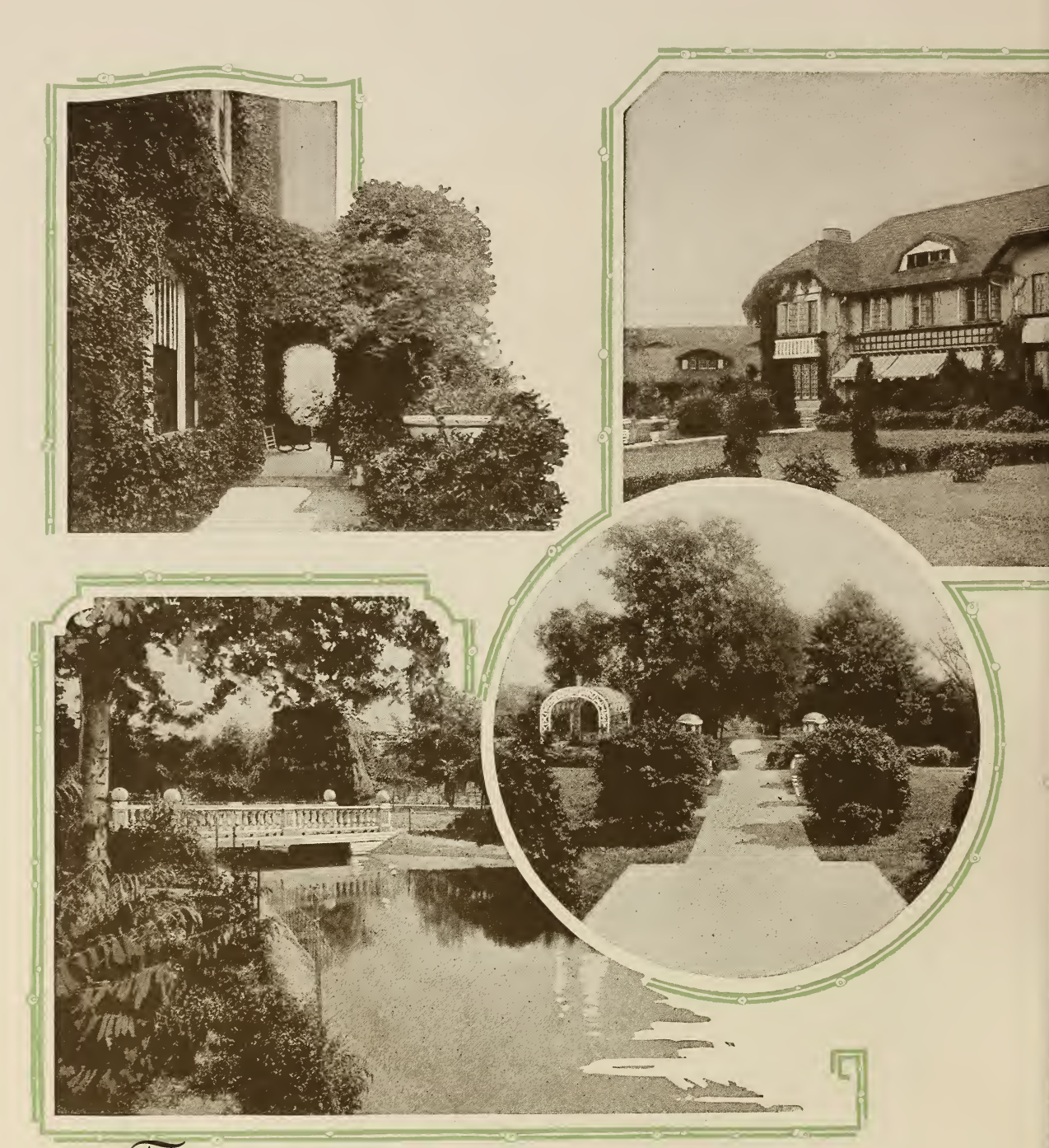
HE endless variety of beautiful plans may be realized when these photographs are studied. They are typical of the many assignments executed each year by our Landscape Gardening Service. Not only is there a greater measure of beauty and charm in Wagner Landscapes, but they are fascinatingly original in their conception.