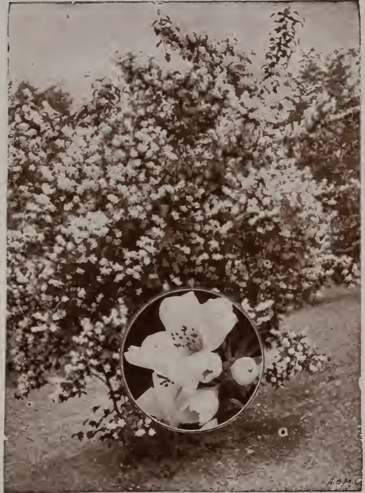
The name Mock Orange is almost a sufficient description.

Spirea Anthony Waterer —Dark crimson flowers in large flat topped clusters in early summer and at intervals till fall if cut as they fade. Dwarf habit. Strong plants. 50c each.