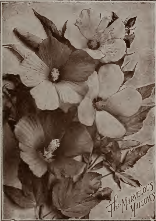
Marvelous Mallows give six to ten weeks of bloom.

One dozen Hardy Flowers in four to six varieties, our selection, all good bloomers, $1.25 or 2 dozen $2.25.