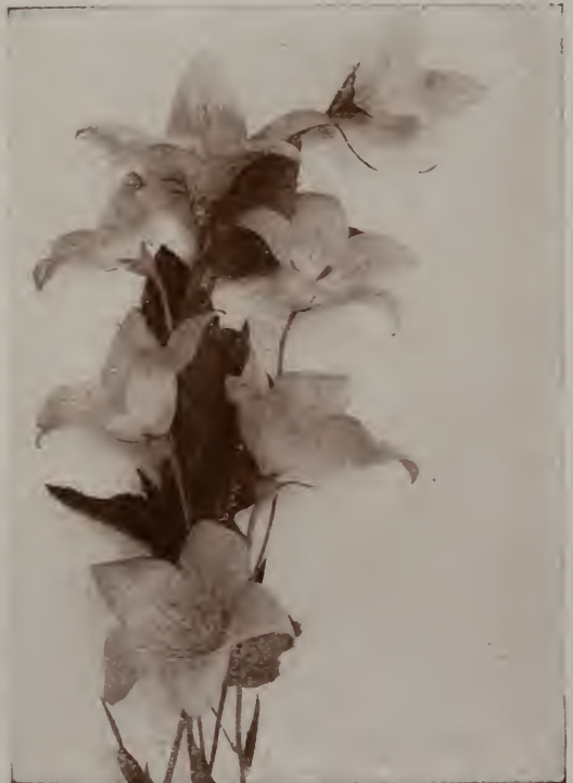
Japanese Bell Flower ( Platycodon )

Larkspur Belladonna —Unrivaled for persistent blooming, with good spikes of the delightful blue of the skies. 20c each, $2.00 per doz.