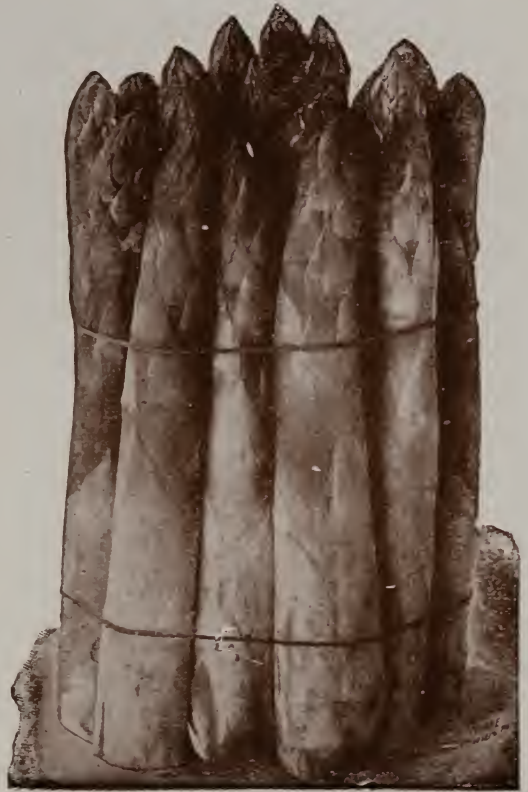
Asparagus is easily grown.

Other varieties will be quoted in the spring catalog or by letter on request. We recommend planting strawberries in the spring.