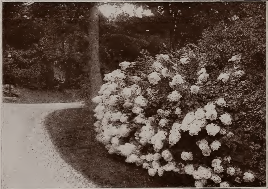
Hydrangea Paniculata Grandiflora blooms profusely in August and September.

Lilacs, French —White, rose, purple. 18 to 24 inches, 75c each.