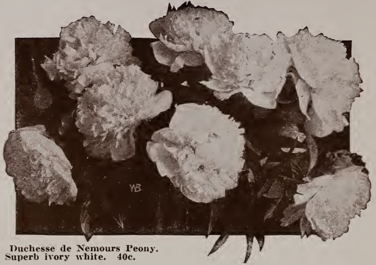
Duchesse de Nemours Peony. Superb ivory white. 40c.

H ARDY as the oak, Peonies are so easily grown that little need be said. Often in neglected gardens one sees large clumps that have flourished and bloomed for years. Yet they amply repay all attention given them. The flowers are large and showy, without being coarse, and range in color from snowy white through all shades of pink and deep red, with even yellow. Many are delightfully fragrant. They give a grand display, blooming here in May.