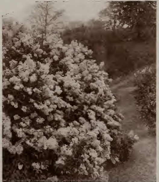
For wealth of bloom and fragrance in early spring no shrub can displace the Lilacs.

1½ to 2 feet.....$0.50 each, $2.50 per 10 2 to 3 feet......40 each, 3.50 per 10