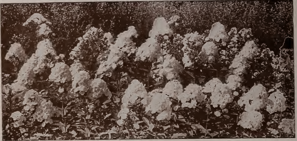
Phlox give brilliant summer effects. Our selection, named varieties, $1.75 per doz.

THESE are easily grown and give brilliant summer effects. Many are delightfully fragrant. They are excellent in a mixed border, but the most imposing effects are produced by planting masses of each color. Plant 18x24 inches apart.