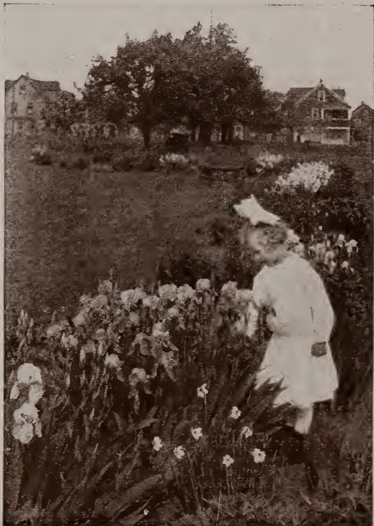
Liberty Irises are easily grown.

Special Collection F —Assorted, our selection: ½ dozen, three varieties, 70c; one dozen, six varieties, $1.25; two dozen $2.25.