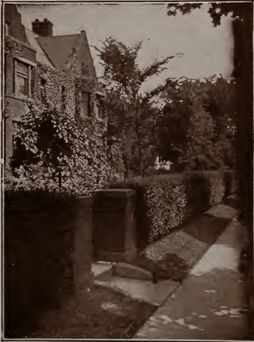
California Privet, perhaps the most popular hedge.

1 to 1½ feet......60 per 10, 5.00 per 100