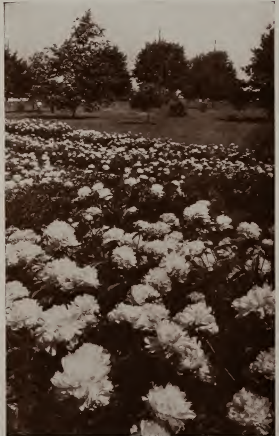
The Peony rivals the rose in fragrance, beauty and variety of form.

If you want something good at a moderate price and do not care about the names, order Pennant Mixed. This is a fine mixture made by throwing together the small plants left from filling many orders, mostly of the best commercial varieties, and grown on till they are ready to divide. Do not ask for certain colors of these as they are grown mixed. 25c each, 5 for 70c, 6 for $1.25, 12 for $2.50, 100 for $16.00.