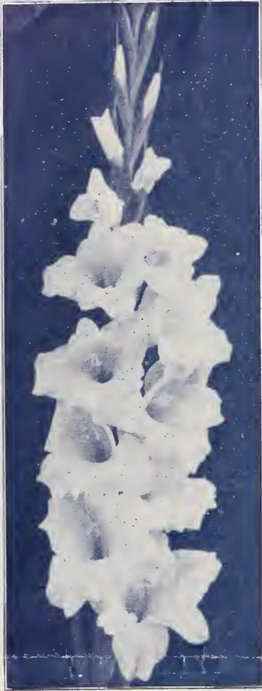
GLADIOLUS L'IMMACULEE pure white. The most perfectly built spike. (See description). Introduction of the well known Hybridizers, Peter Hopman & Sons, Hillegom, England.