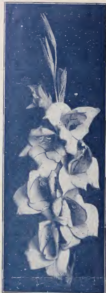
Large-Flowering Primulinus Hybrid Gladiolus