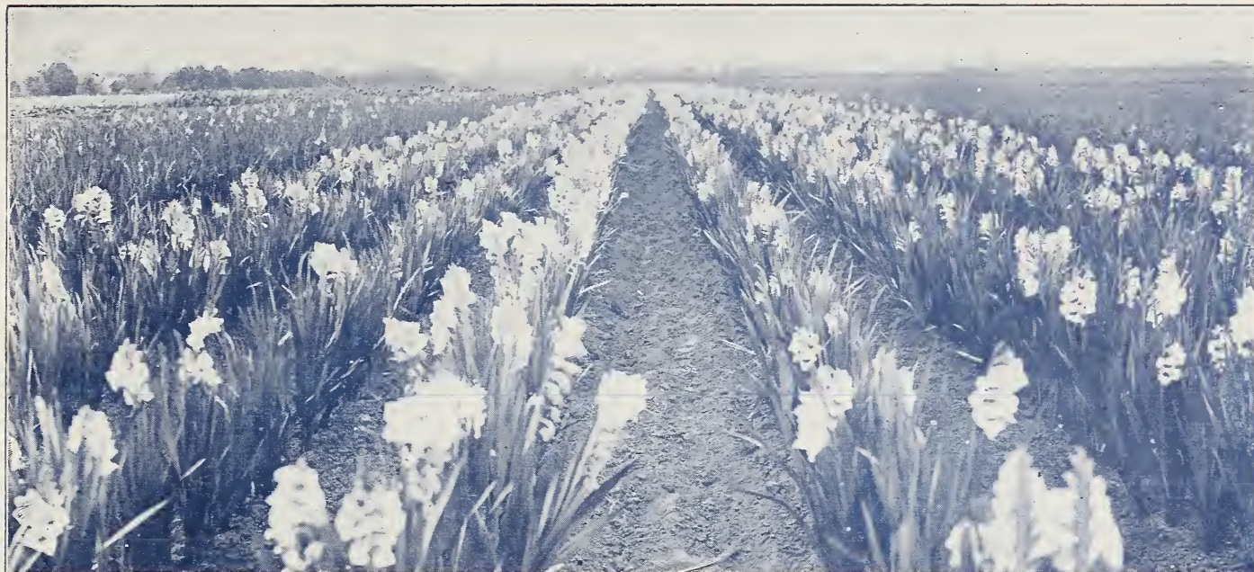
Hazelcrest Gladiolus Farm of the American Bulb Co. Variety Schwaben in Foreground. Note Wonderfully Strong Growth of Plants. Liberal Spacing Insures A. B. C. "Supreme Quality" Bulbs

Don't fail to include the new pure yellow, Flora, in your list. It is a winner (see illustration on first page). —A. B. C.