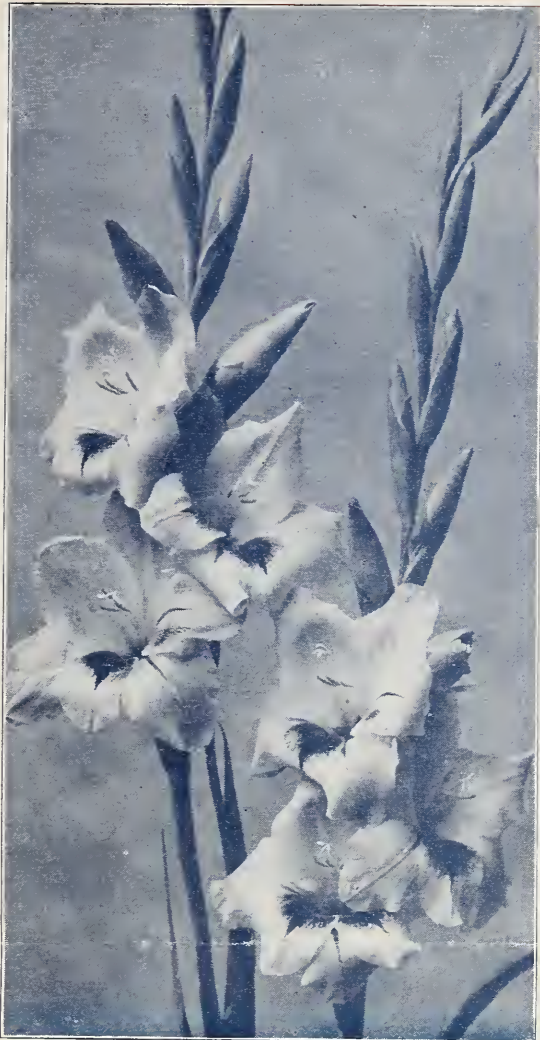
LARGE FLOWERING GLADIOLUS