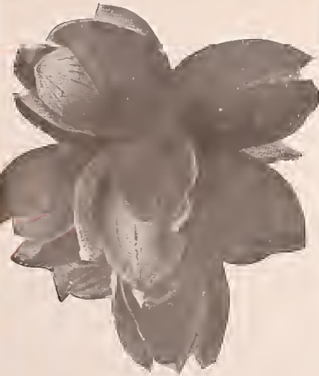
Beautiful Cluster of Ripe Pecans

Lumberton is just 90 miles north of New Orleans on the Southern Railroad and Gulf and Ship Island Railroad. Fine churches, schools and good roads and good people throughout this section. Investigate Lumberton and its possibilities.