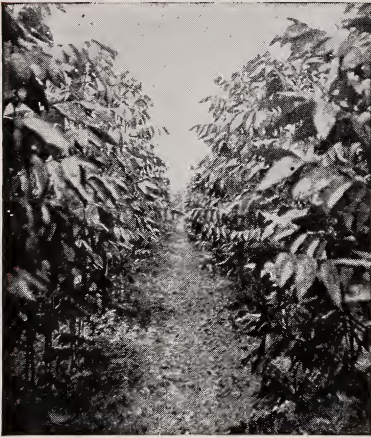
Looking Down One of the Rows in Our Nursery of Bred-Up Pecans

There are more than fifty different varieties of the paper-shell pecan, and out of this number we have selected the kinds we list as the best all-round varieties. One variety will excel others in one particular or more, but fall so far short of equalling them in other ways that it has to be discarded as an undesirable sort. The varieties we list have all been tested and proved to be suitable to the different kinds of soil we have in the Cotton belt of the South. Naturally one kind will suit one soil better than another, and it is for this reason that every buyer should tell the nurseryman the kind of soil he has and get his advice about variety. But we have no hesitancy in saying that the Stuart, Success, Schley, and Bass Paper-shells are the peer of them all as all-around nuts, and are the safest of all to plant.