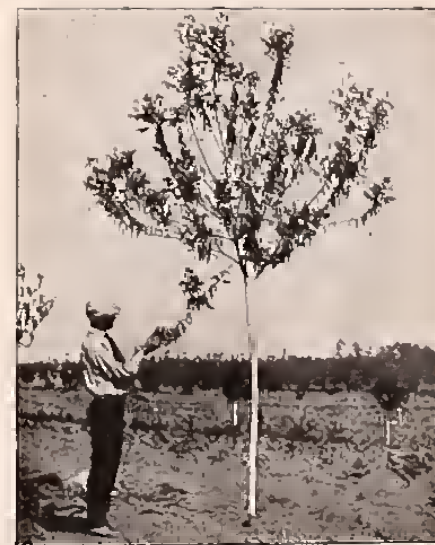
Our Bred-Up Trees Bearing Heavily Third Year Set Out

Cotton, corn, truck—practically every thing has to be planted over again every year. Practically every thing except pecans. One planting lasts a lifetime. What else can you put out that will make you good profits every year, steadily make you larger profits, and continue not only all your lifetime but on through the lifetime of your youngest child? What else will do that—except pecans? One thousand dollars has been offered for proof that any single pecan tree ever quit bearing, or died, on account of old age. You can't say this for any other fruit tree that grows.