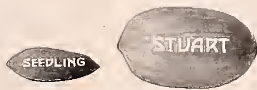
Compare Our Bred-Up Pecan With the Seedling

No planted pecan nut will reproduce the parent tree in all respects. You might plant the largest pecan nut in the world and when it came to bear nuts would be as small as the smallest one shown here. There's a reason and it is this: budded and grafted trees have been improved only in recent years and the tendency in pecans, as in all other things, is to breed back to the way they were produced for the longest period of time.