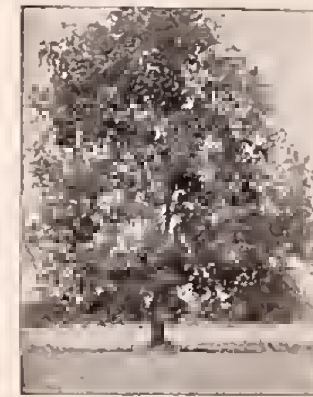
This 100-Year-Old Pecan Tree Produced $100.00 Worth of Nuts Last Season

The improved bred-up papershell pecans usually begin to bear the second or third year set out. As the trees get older the bearings grow heavier. The largest crops of pecans on record have all been made by the largest and oldest trees. And there is no record of any pecan tree dying or falling to produce its annual harvest of nuts on account of old age.