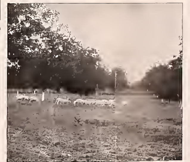
Sheep Grazing in a Fine Papershell Pecan Orchard

The pecan trees will not only send the boys and girls off to school but they will keep on producing, year in and year out, indefinitely. And each year as the tree grows older, the nut crops will be heavier, and the profits bigger. Can you think of any other investment you could make for your children's future that will equal that?