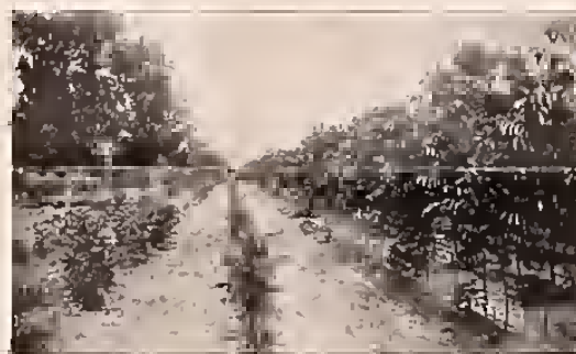
Our Beautiful, Vigorous Nursery Stock

Be sure to plant you an orchard or at least a few trees this year and share in the great profits in store for those who grow delicious papershell pecans for the market.