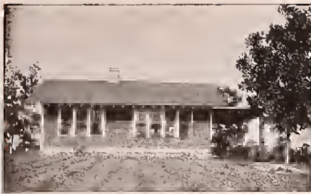
Office Bass Pecan Company