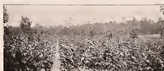
Our Vigorous, Healthy and Highly-Bred Trees—Compare With Above

Vigorous and healthy field grown bred-up trees are the only kind it pays you to plant and this is the only kind we sell. Naturally, you pay a little more for them.