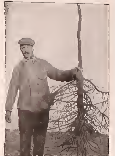
Root System of Our Pecan Trees Finest in the World

Landscape gardeners rank the pecans among the choicest shade trees for the South. It is naturally a straight, upright, vigorous growing tree and its foliage is remarkably rich and beautiful. Our bred-up trees grow larger and larger with age—in time becoming as majestic and friendly a "shade" tree as any fine oak or elm. On hundreds of school grounds in the South bred-up pecan trees are being set out both for shade and for nuts. Oaks, elms, china trees, etc., are being replaced by the hundreds with papershell pecan trees on the grounds of private residences.