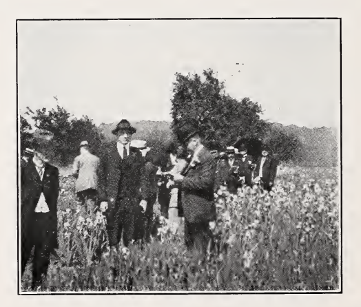
Note-Taking in Vilmorin's Iris Fields, near Paris