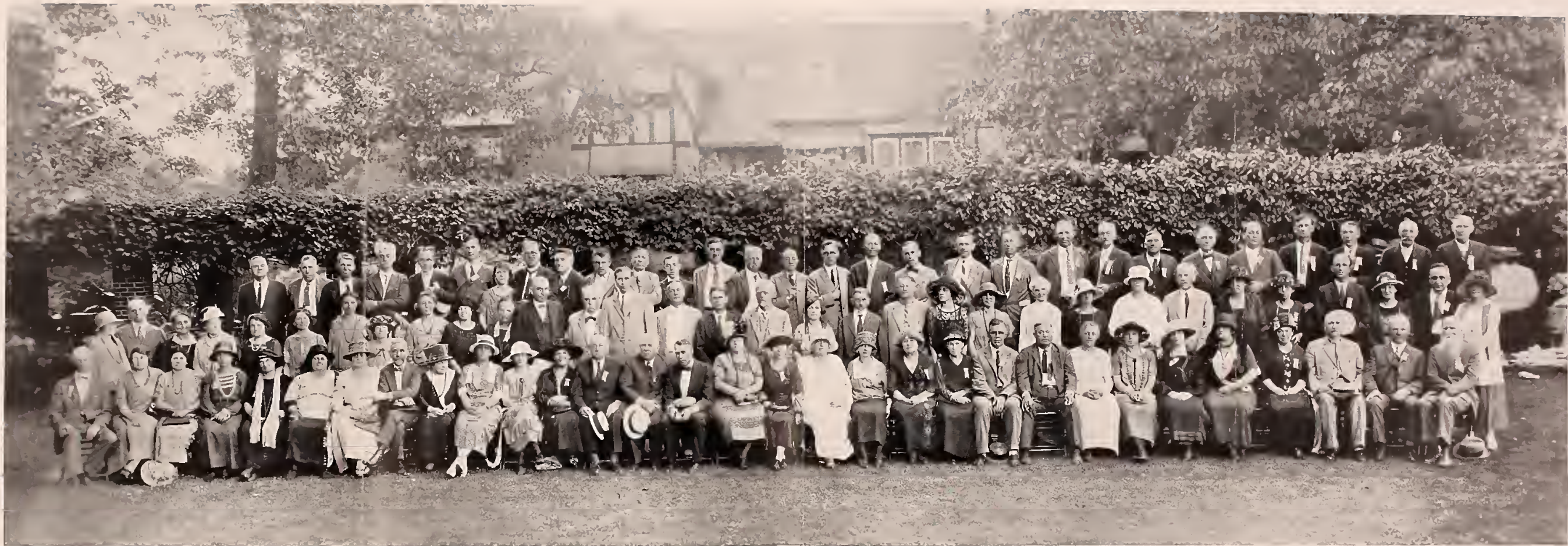
The Chamberlain Garden Party Group, Des Moines Peony Show, 1924.