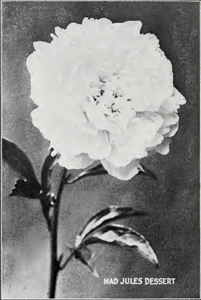
MAD JULES DESSERT