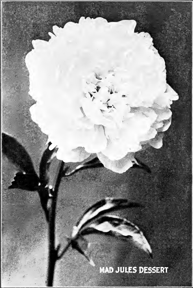
MAD JULES DESSERT