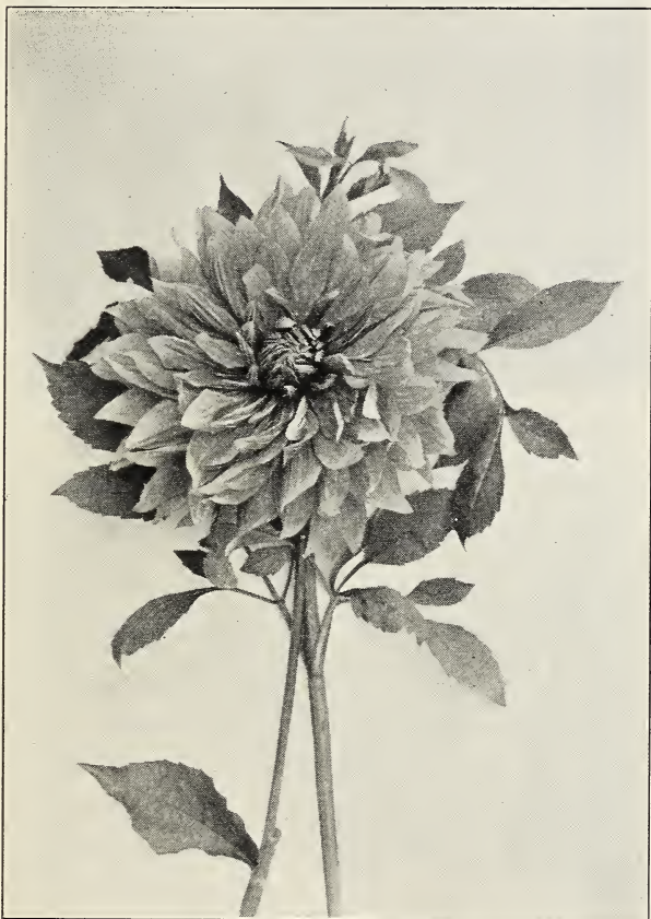
George Walters — Cactus

Not less than six of one variety at the ten rate