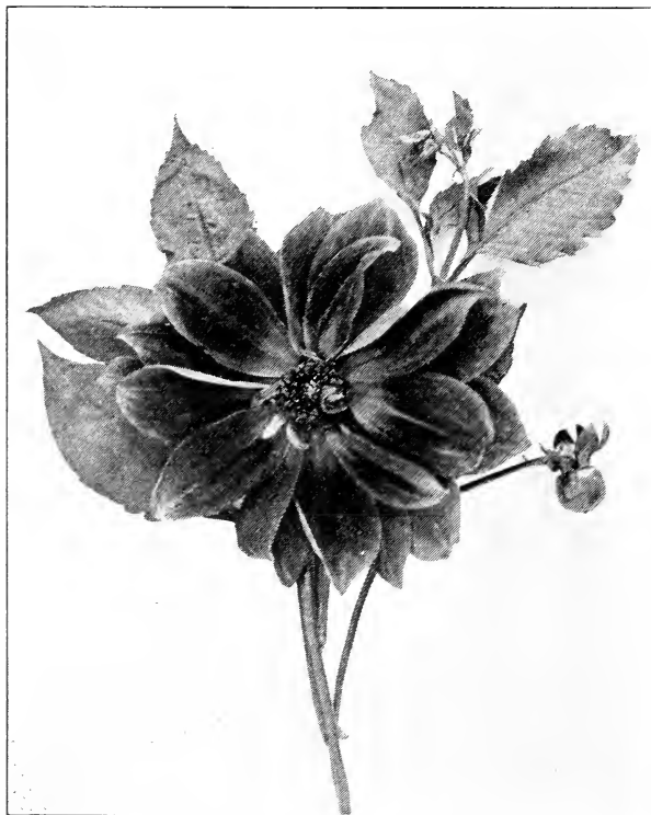
Scarlet Century — Single