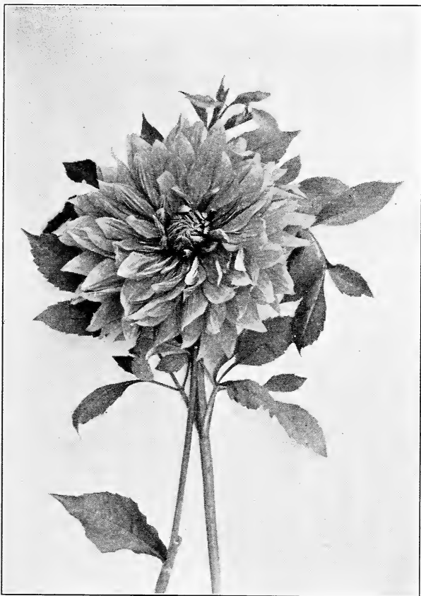
George Walters — Cactus

Not less than six of one variety at the ten rate