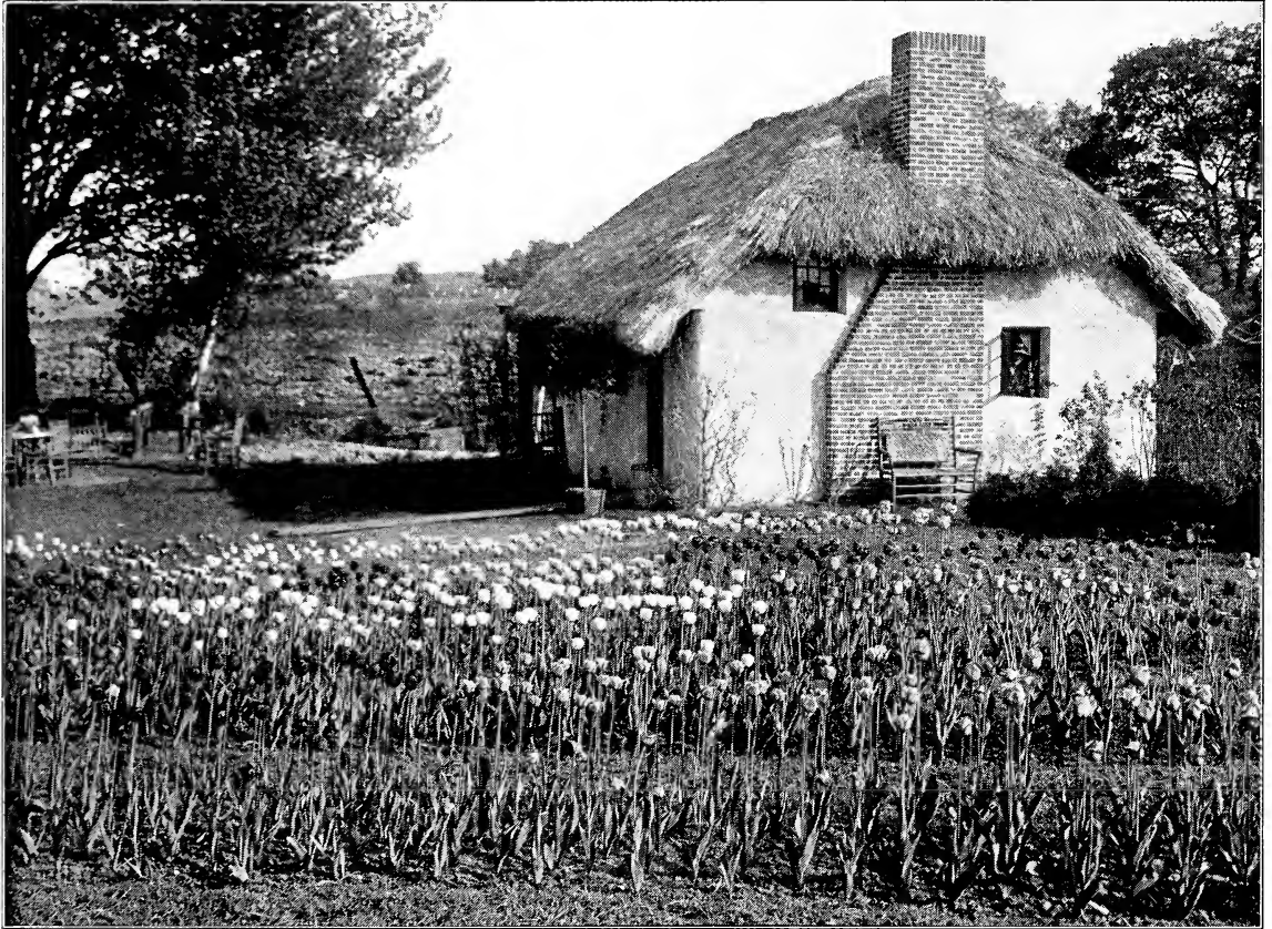
Darwin Tulips in the Dutch Garden, Bloemgaard, at our Nurseries in Lexington

This year we made a special importation of Holland Bulbs which will be displayed in bloom in our Trial Grounds at our Nurseries in Lexington for the benefit of our discriminating patrons in order that they may view and select the varieties they desire for planting in the Autumn. Notice will be sent in May.