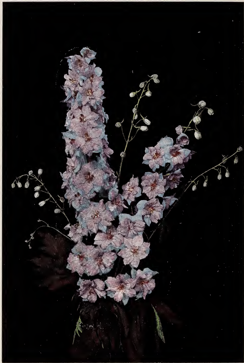
THE BURNS NEW HYBRID DELPHINIUM (Natural Colors)