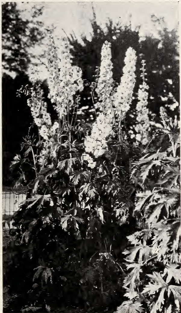
THE BURNS NEW HYBRID DELPHINIUM (Growing Plant; Height 6 Feet.)