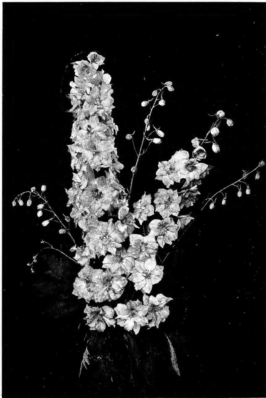
THE BURNS NEW HYBRID DELPHINIUM (Natural Colors)