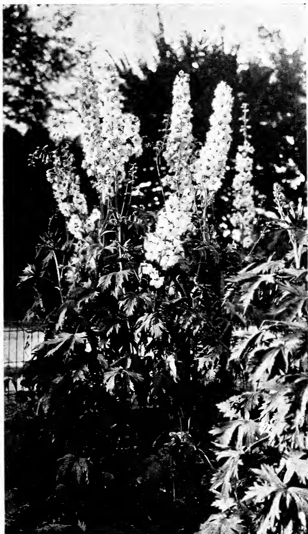
THE BURNS NEW HYBRID DELPHINIUM (Growing Plant; Height 6 Feet.)