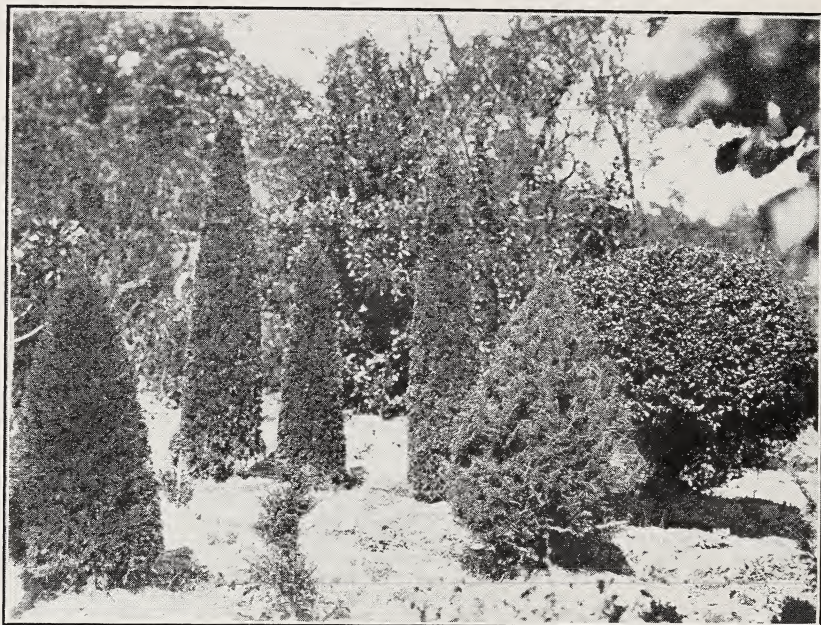
Cupressus Thuoides (Native Juniper)