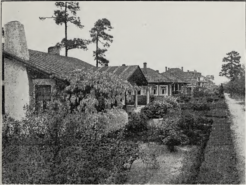
A Street in Southern Pines, N. C. Plants furnished by Deaton Nurseries.