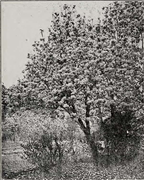
Cornus Florida (Dogwood)