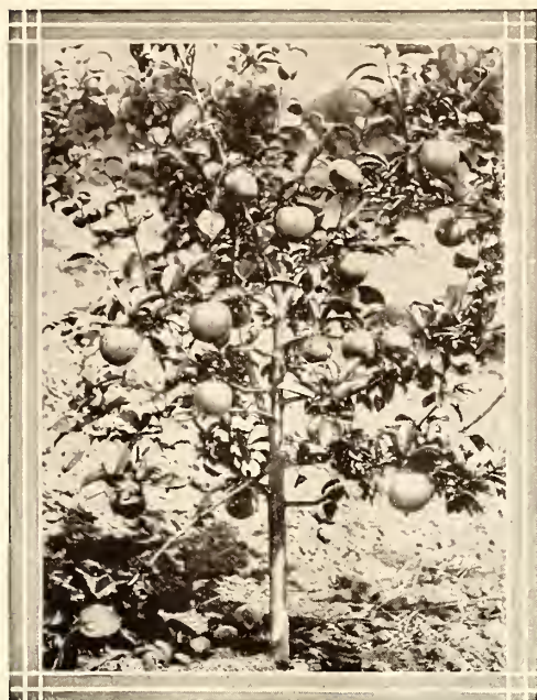
RED ASTRACHAN DWARF, 3 YEARS OLD