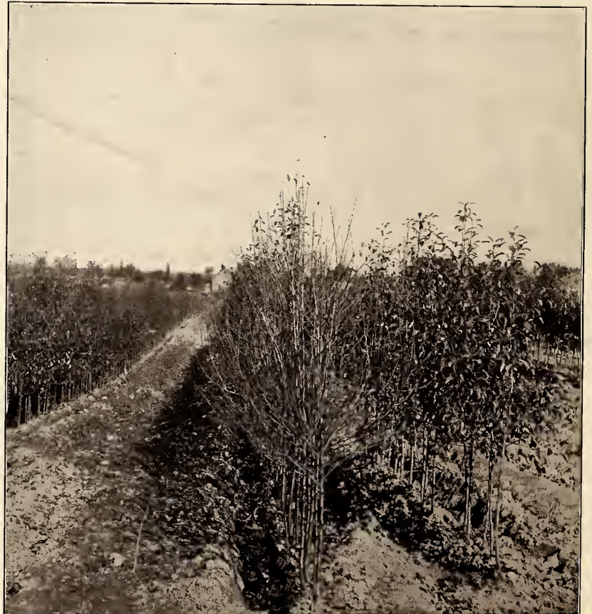
A corner of one of our blocks of Standard Pear Trees. The leaves have been removed from some of the trees in the immediate foreground to show how well the tops of the trees are branched.