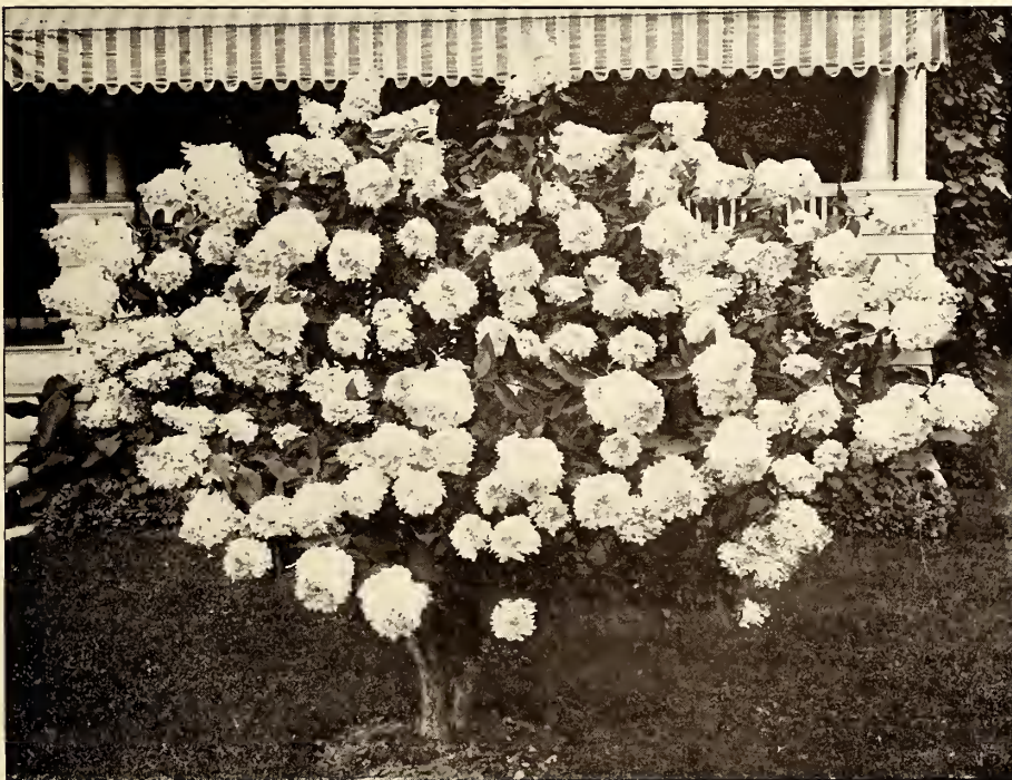
HYDRANGEA PANICULATA GRANDIFLORA

DUTCHMAN'S PIPE —Large heart shaped leaves with brownish flowers resembling in shape a miniature pipe. Very desirable for a sunny veranda. Price, $1.15 each; $10.00 per 10.