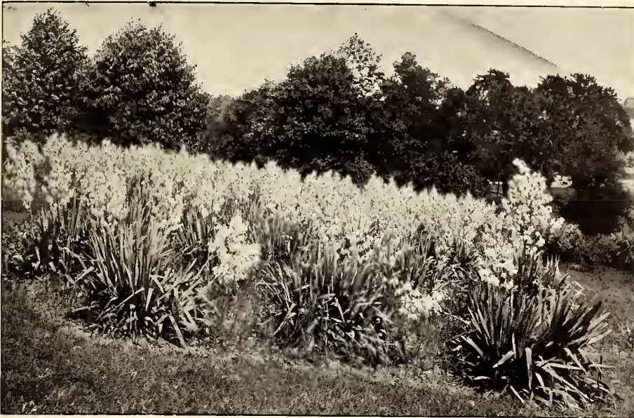
A BED OF YUCCA

Don't overlook this subtropical plant. It is very distinctive.