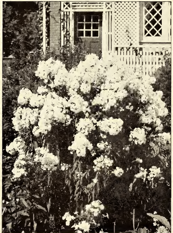
A CLUMP OF HARDY PHLOX

Prices of Green's Mixture—25c each; $2.25 per 10.