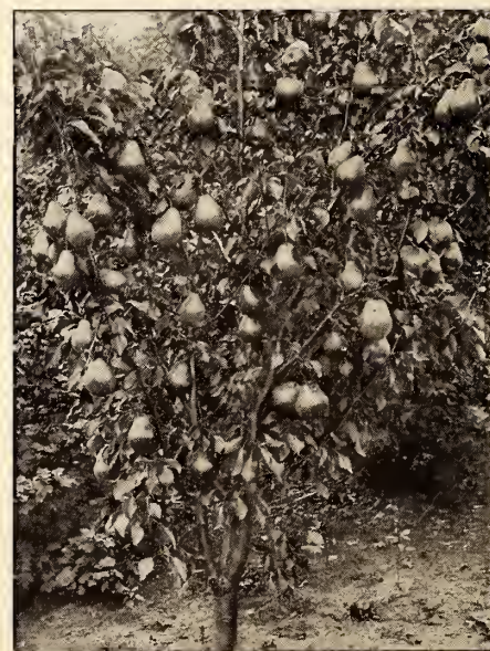
DUCHESS DWARF PEAR TREE

ANJOU —Large, greenish yellow shaded with crimson. Prolific. October. Standard and Dwarf. BOSC —Best quality of all. Large gourd shaped, deep russet yellow. Fine flavor. A long keeper. Standard only. Largest size, 6 to 7 ft., $2.00 each, $19.00 per 10. Medium size, 5 to 6 ft., $1.50 each, $14.00 per 10. DUCHESS —A fine commercial sort when grown as dwarf. Large, greenish yellow, very prolific and a fine keeper. October. Dwarf only. KIEFFER —Good commercial variety. Not as high quality as Bartlett, but a good canner. Strong grower, prolific. Golden yellow. October. Standard only. LAWRENCE —Best very late variety. Medium, golden yellow. December. Standard and Dwarf. SECKEL —Small, fine flavor. Excellent for pickling. September. Standard and Dwarf. SHELDON —A large round golden russet pear of the finest flavor. October. Standard only. WORDEN SECKEL —An improved Seckel. Golden yellow with crimson cheek. October. Standard and Dwarf.