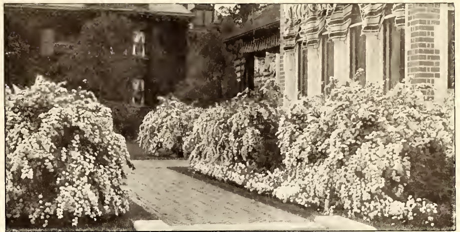
SPIRAEA VAN HOUTTEI

GOLDEN SPIREA —Bright yellow leaves in spring gradually changing to golden bronze in fall. Grows 6 to 8 ft. tall.