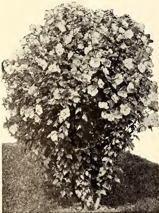
ALTHEA (ROSE OF SHARON)

WHITE BUSH HONEYSUCKLE —Similar to the pink bush honeysuckle in growth and height. Creamy white flowers in May and June followed by the orange berries in summer and autumn.