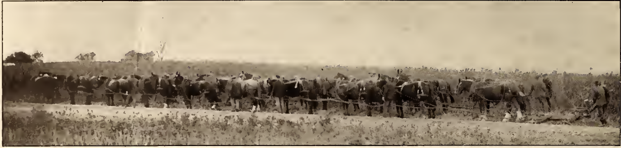
Digging trees at Green's farm. We use 10 teams — 20 horses — on our tree digger. Plenty of power like this enables us to keep the blades of the digger down deep in the soil. This insures plenty of strong fibrous roots.