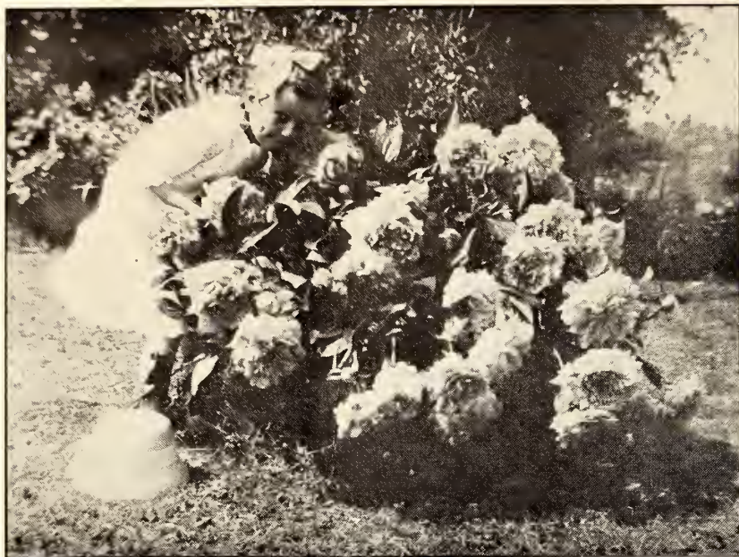
A CLUMP OF PAEONIES

Some say they rival the rose in beauty; others say the rose rivals the peony. It is a question hard to decide—they are both so beautiful