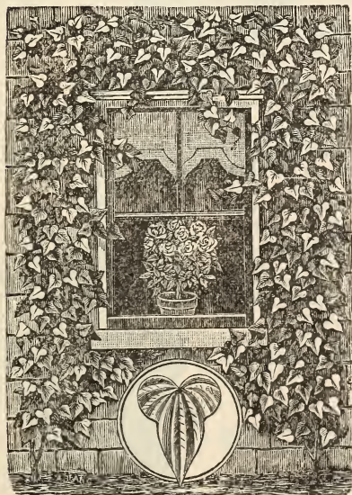
CHINESE CINNAMON VINES

One of the finest plants for rapidly covering trellis work we know of. Unexcelled for rapid growth. A great bloomer. Very sweet fragrance. Two for 5 cents and 5 cents each.