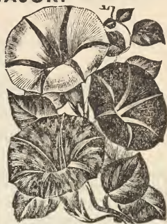
IMPERIAL JAPANESE MORNING GLORY.

Common, Mixed. Large packet, 5 cents, ounce, 15 cents.