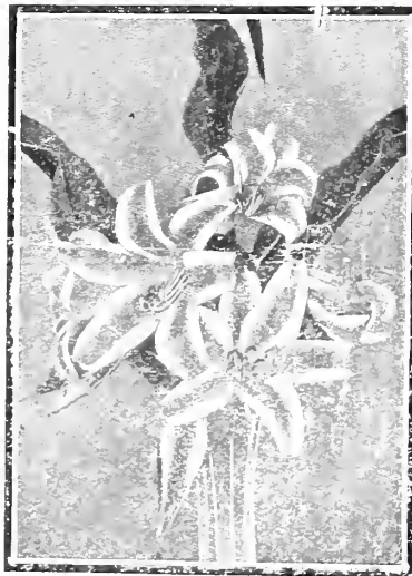
LILY OF ORINOCO