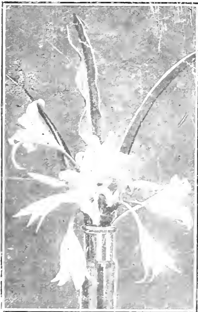
WHITE CAPE LILY Duplica' of Easter Lily

GROUND STORAGE is had for all bulbs. That is, they are not dug until wanted to ship so you get fresh, plump, strong, quick-growing bulbs.