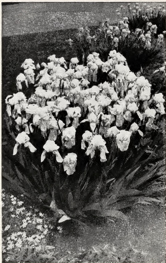
Pallida Dalmatica. (See page 11.)