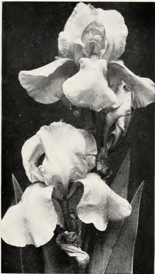
Sherwin-Wright. (See page 11.)