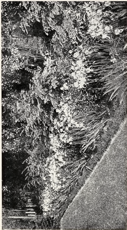
A Beautiful Border Planting of German Irises.