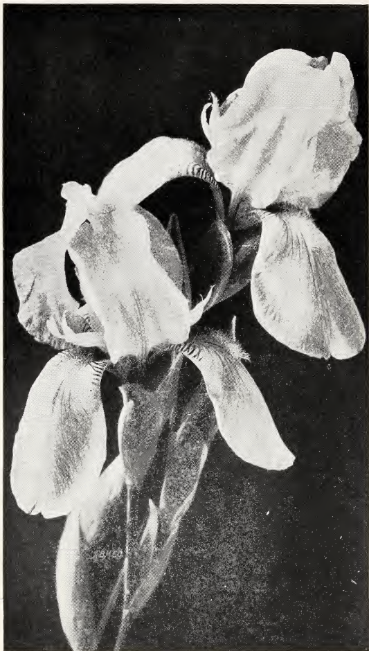
Flavescens. (See page 9.)