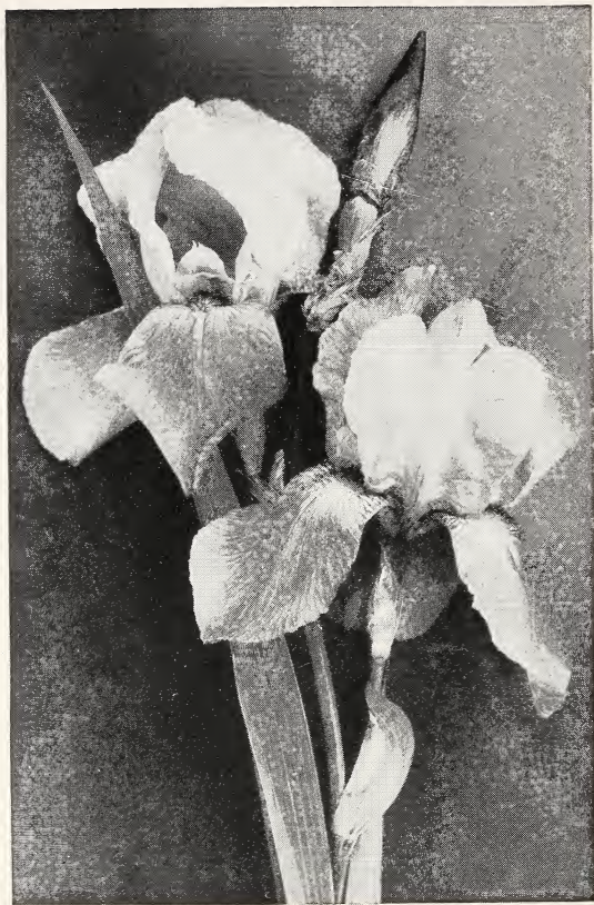
Aurea. (See page 7.)