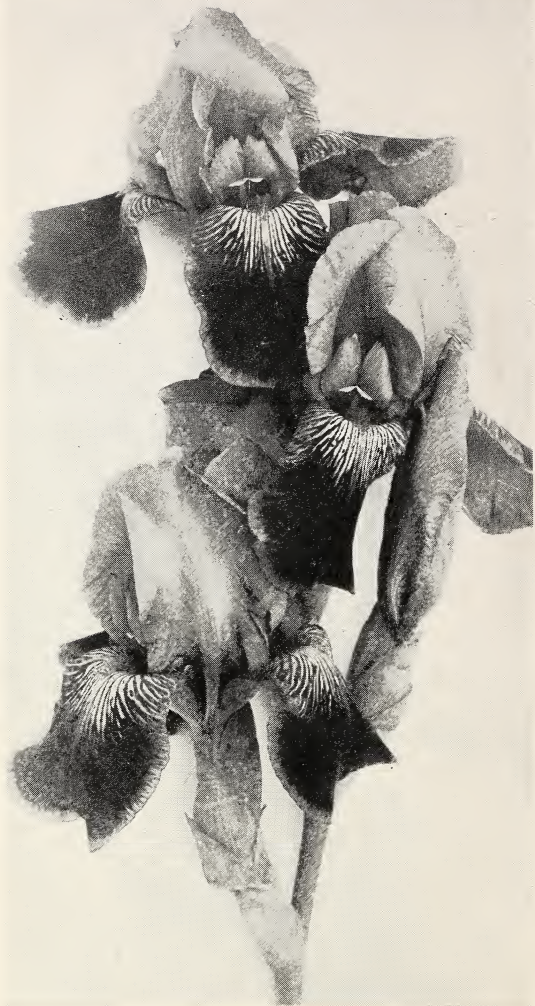
Iris King. (See page 9.)