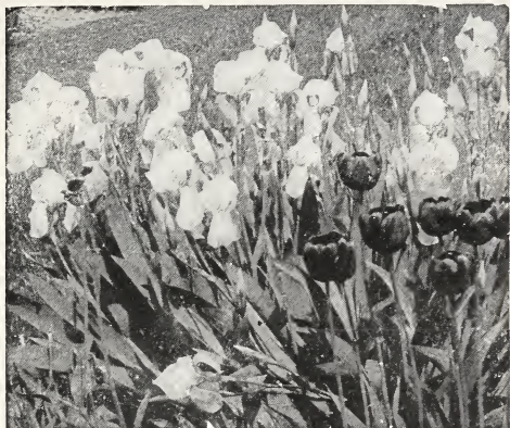
Florentina. (See page 9.)

Very few flowers can equal the Iris in stately majesty and orchid-like beauty. In fact it is often called "the poor man's orchid." It is of the easiest possible culture, perfectly hardy in any well drained soil, and single plants will soon grow into large, showy clumps. It is fine for use in borders, among shrubs, and as isolated specimens.