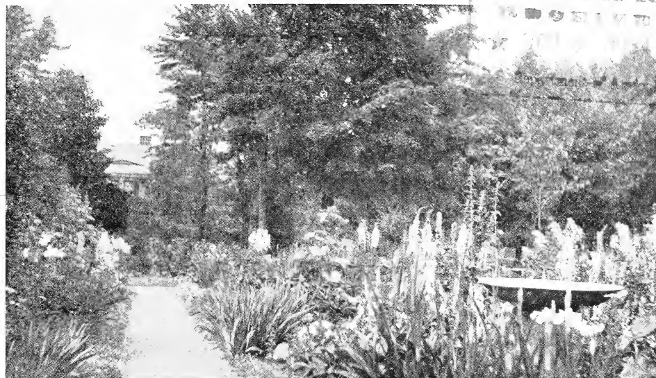
A Corner in the Garden at Iriscrest