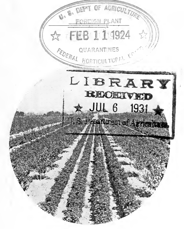
Norway Maple in Seedling Rows