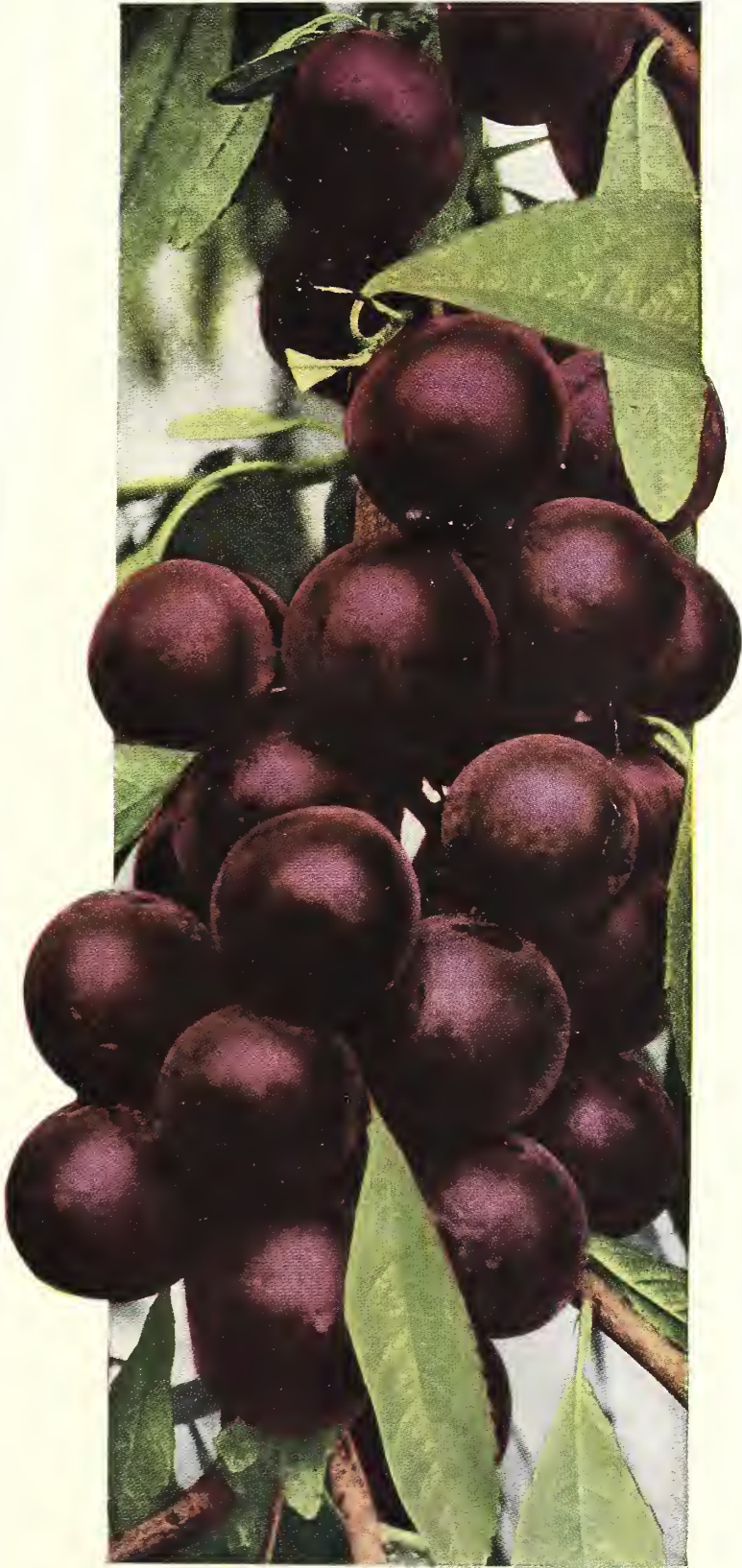
ZUMBRA. Natural size.