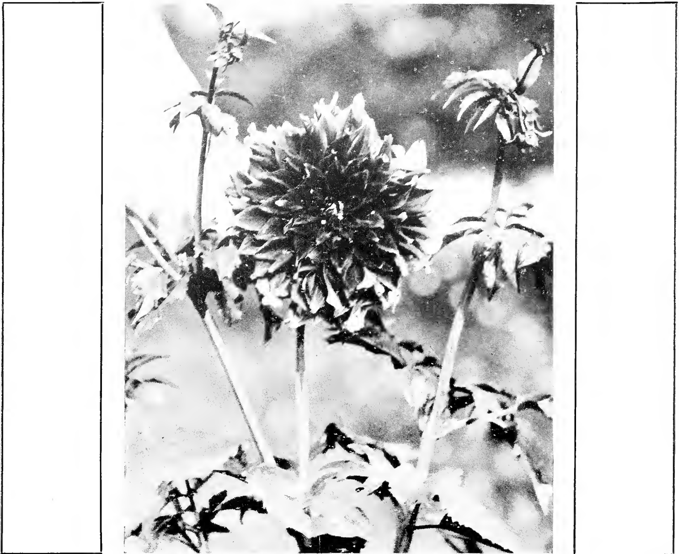
The Dahlia "OHIO"—showing wonderful large flowers on long, strong stems