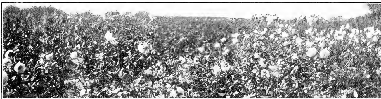
VIEW OF ONE OF E. H. BROWN'S 6-ACRE DAHLIA FIELDS

In addition to his dahlias he is experimenting in perfecting a type of aster that will start blooming early in June and will continue until freezing weather. The flower is formed like a chrysanthemum with leaves curling toward the center. Brown has propagated the flower until it has an exceptionally long stem and is surrounded by a calyx of deep green.