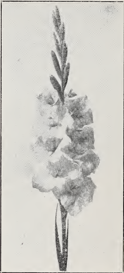
Byron L. Smith

ALICE TIPLADY —(Kunderd) A grand, large Primulinus Hybrid of most beautiful orange saffron color. Very choice. 10c each; $1.00 per doz.