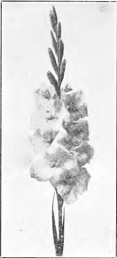
Byron L. Smith

ALICE TIPLADY —(Kunderd) A grand, large Primulinus Hybrid of most beautiful orange saffron color. Very choice. 10c each; $1.00 per doz.