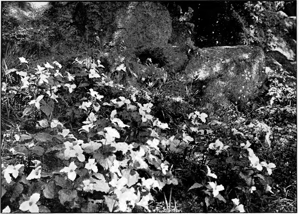
Trillium grandinorum (See page 6)