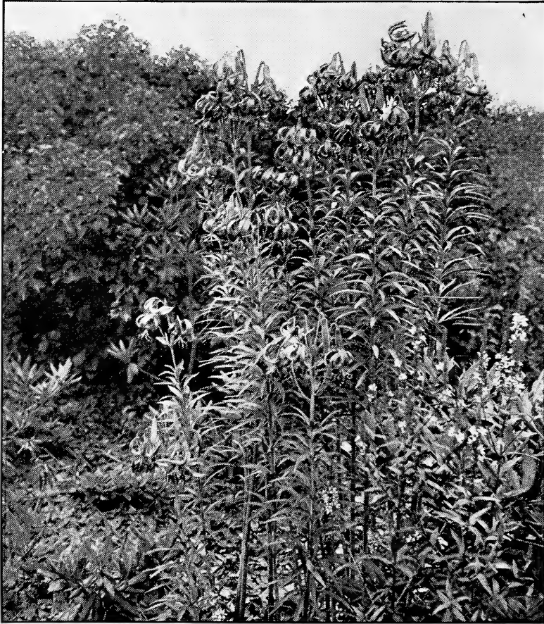
Lilium superbum (See page 5)