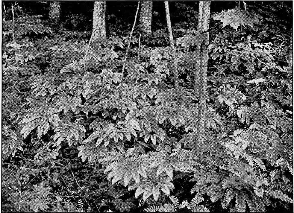
Adiantum pedatum (See page 2)