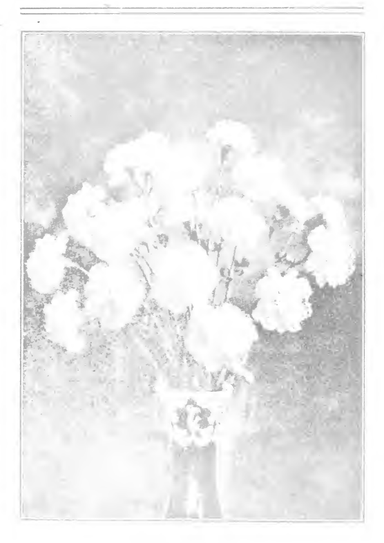
For Sale by S. S. SKIDELSKY & CO. 53 Park Place NEW YORK CITY