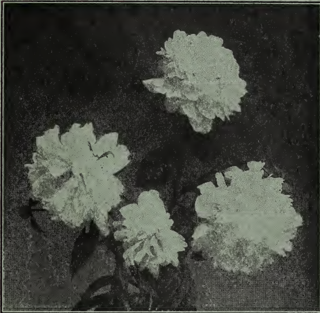
WELLER'S BETTER PEONIES