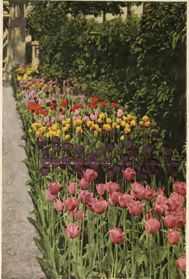
Breeder and Darwin Tulips make splendid borders for walks

Superfine Mixture of Double Early Tulips, including all of the above, 65 cts. per doz.; $4.50 per 100; $38 per 1,000.