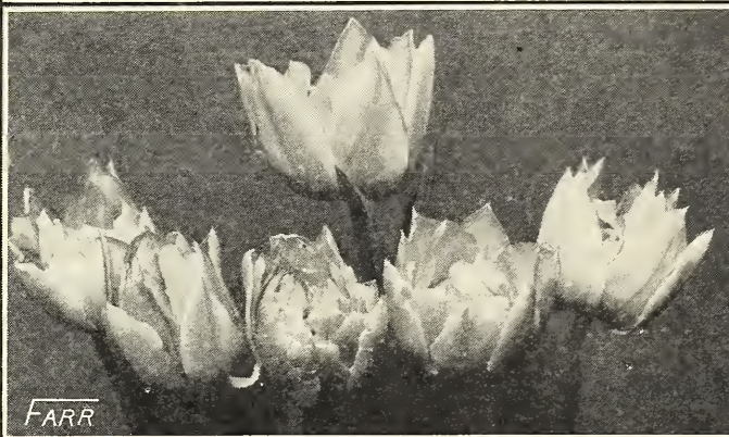
Farr's Single Early Tulips in a city park Farr's Tulips in a Wyomissing garden