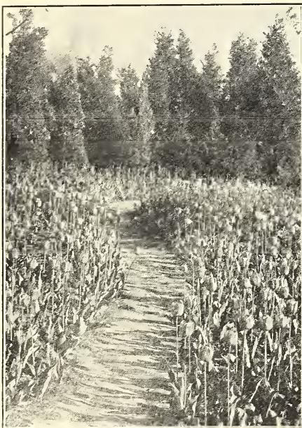
Can you imagine the brilliancy and beauty of these Darwin Tulips?

Gen. de Wet. Deep orange, shading to golden yellow at base of petals. One of the finest newer sorts. No other orange Tulip equals it in brilliance. We recommend it for bedding and for forcing. 30 cts. each; $3 per doz.; $22 per 100.