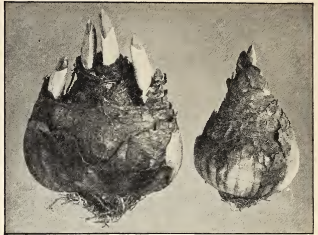
Two types of Narcissus bulbs showing "Farr's Mother Bulb" in comparison with the ordinary first-size bulb. We buy the best bulbs obtainable

You can readily make up an order from the Farr bulb list contained in this issue of BETTER PLANTS. Since 1923, the list has been reduced by more than 75 lesser varieties, so that this 1925 list includes only the very best varieties of each type and color. Run through the list and select your favorite