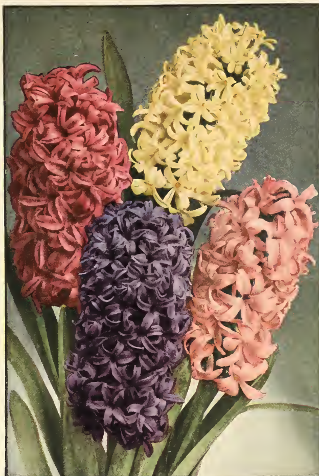
Roi des Belges Yellow Hammer King of the Blues Queen of the Pinks

The Breeder Tulips are the unbroken forms of the old florists' Tulips. The blooms strongly resemble the Darwin Tulips, excepting that they have an entirely different range of color, comprising artistic tones of bronze, terra-cotta, orange, and brown. Breeder Tulips are May-flowering, producing blooms of enormous size, and because they are vigorous growers are valuable for the garden. We have taken great pains to select only