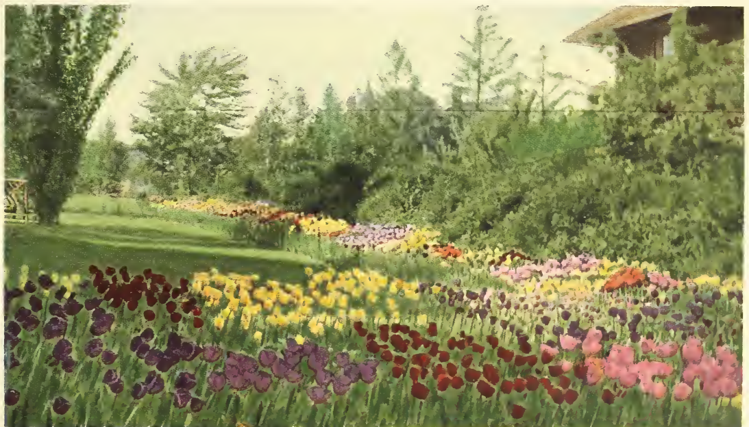
Breeder and Darwin Tulips are the long-stemmed late-flowering varieties

Campernelle rugulosus flore-pleno. Flowers fragrant, quite double, and borne on tall, sturdy stems. A very desirable variety. 75 cts. per doz.; $5.50 per 100; $45 per 1,000.