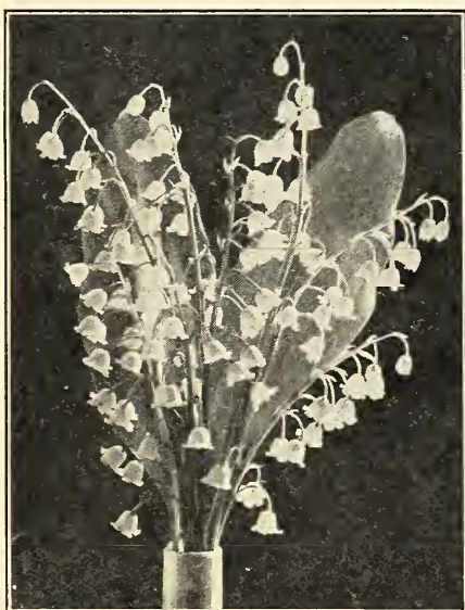
Lily of the Valley

Dream. Pale heliotrope, shaded violet. 70 cts. per doz.; $5 per 100.