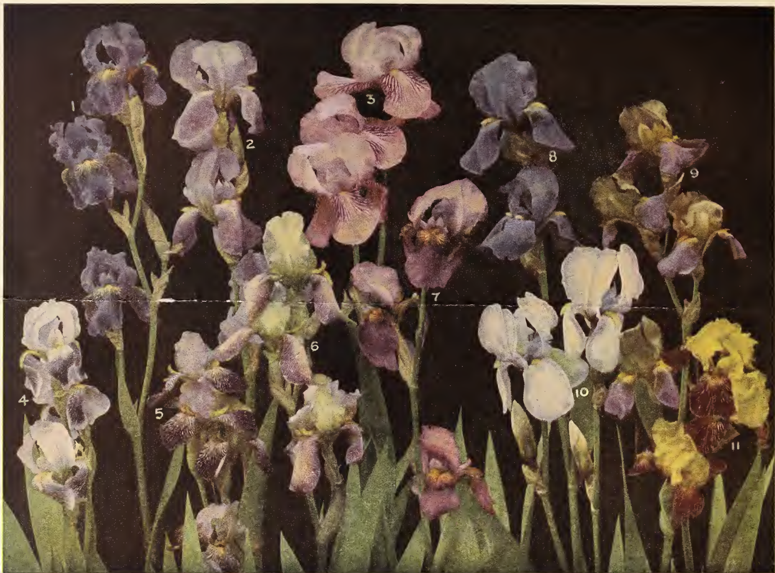
An example of the variety and contrast of color to be found in Irises