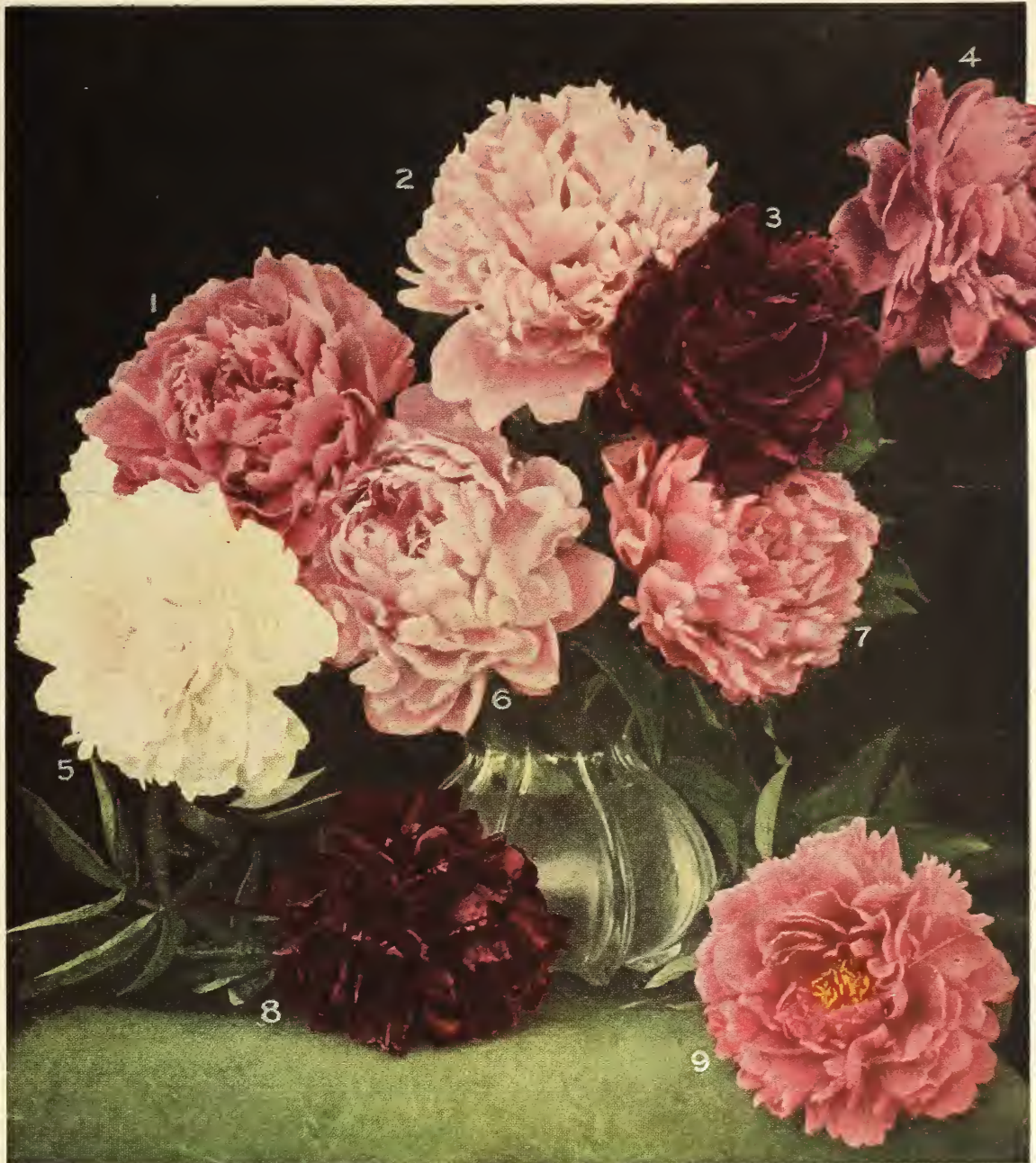
Peonies are exceedingly effective as cut-flowers and will last for many days

Not less than six bulbs of any variety supplied