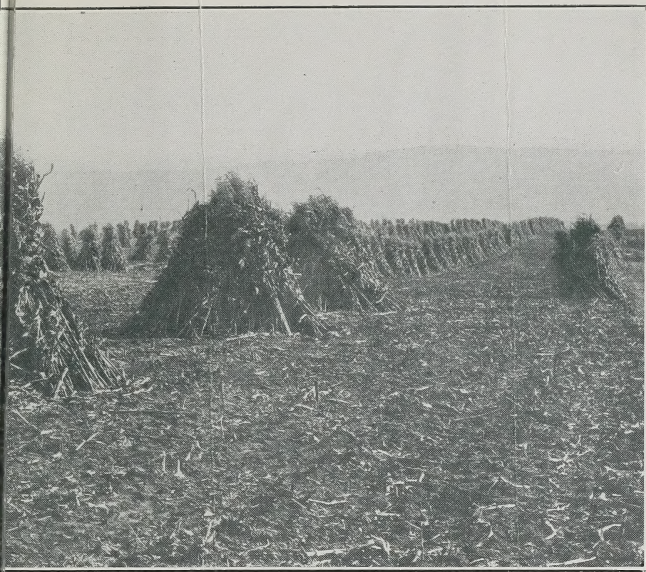
BUSHELS PER ACRE IN FRANKLIN COUNTY