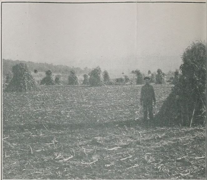
LOONEY CORN. THIS FIELD AVERAGED 1 8