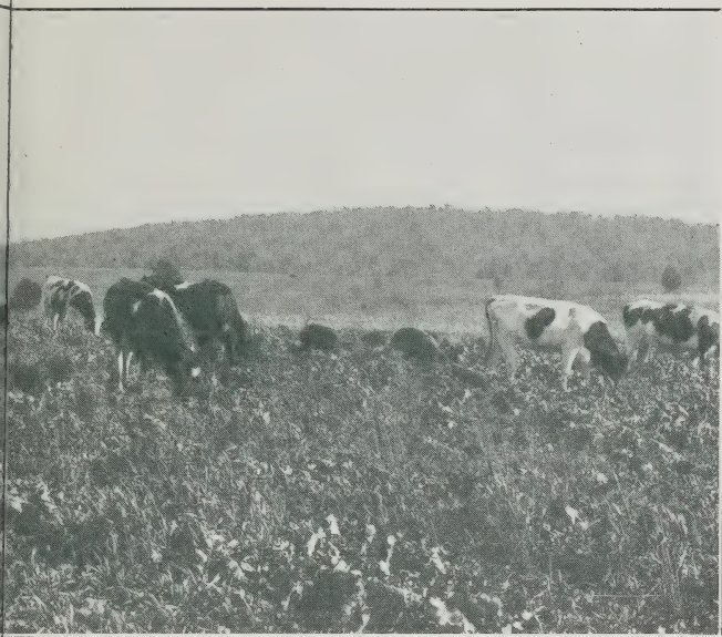
ON CLOVER, TURNIPS AND RAPE, IN FRANKLIN COUNTY

long shanks that turn down, which keeps the rain from running down in the shuck and damaging the corn. The stalk is not large, but has heavy blades and produces usually two ears to the stalk. It throws out good heavy spur roots and, not being tall, stands up well where other varieties will blow down in case of heavy wind. It matures early and will do to crib or feed from two to three weeks earlier than other varieties. On account of the small stalk, this corn can be planted much thicker than the usual varieties. It is especially adapted to thin land and will make a good, solid ear where a large variety will only produce the stalk. On good land, well cultivated, this corn will produce from sixty to eighty bushels per acre. One crop in this county averaged 115 bushels to the acre. Six boys of the Boys' Corn Club of Franklin County averaged over 100 bushels to the acre, and at the Tennessee State Fair these boys won first prize with Looney Corn over all other exhibits.