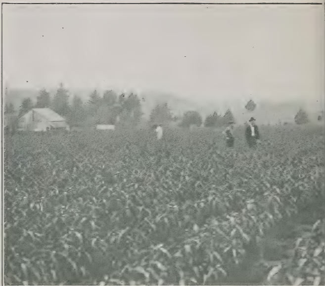
A FIELD OF JUNE BUDDED PEAS.