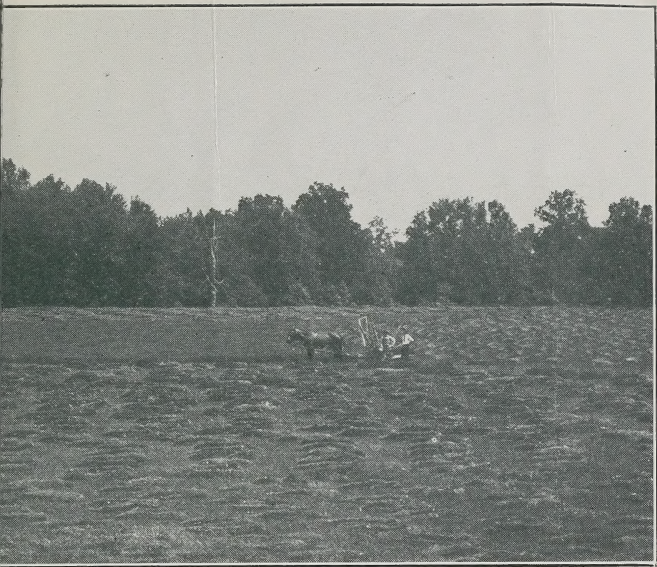
VER IN FRANKLIN COUNTY