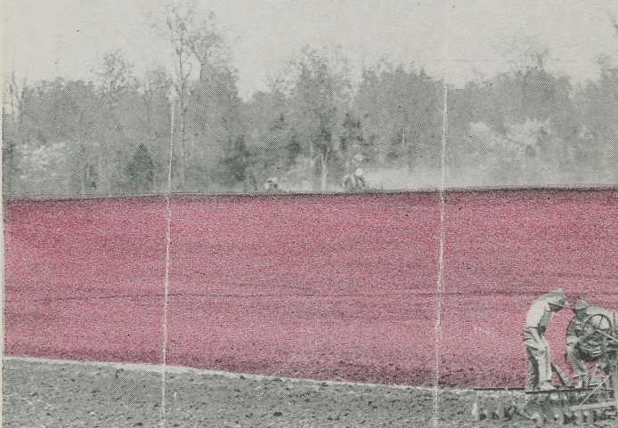
FIELD OF CRIMSON CLOVER BEING PLOWED UNDER FOR CORN, IN FRANKLIN COUNTY

BUSINESS ESTABLISHED JANUARY 1, 1897 NEW BUILDING ERECTED 1920