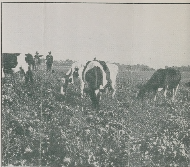
A HERD OF DAIRY COWS GRAZING ON A FIELD OF CR

is to some of the Northern sections. However, it is grown in a great many sections of the South.