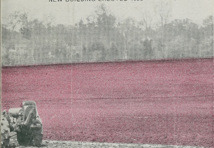
FIELD OF CRIMSON CLOVER BEING PLOWED UNDER FOR CORN, IN FRANKLIN COUNTY

BUSINESS ESTABLISHED JANUARY 1, 1897 NEW BUILDING ERECTED 1920