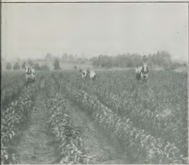
TREES IN FRANKLIN COUNTY