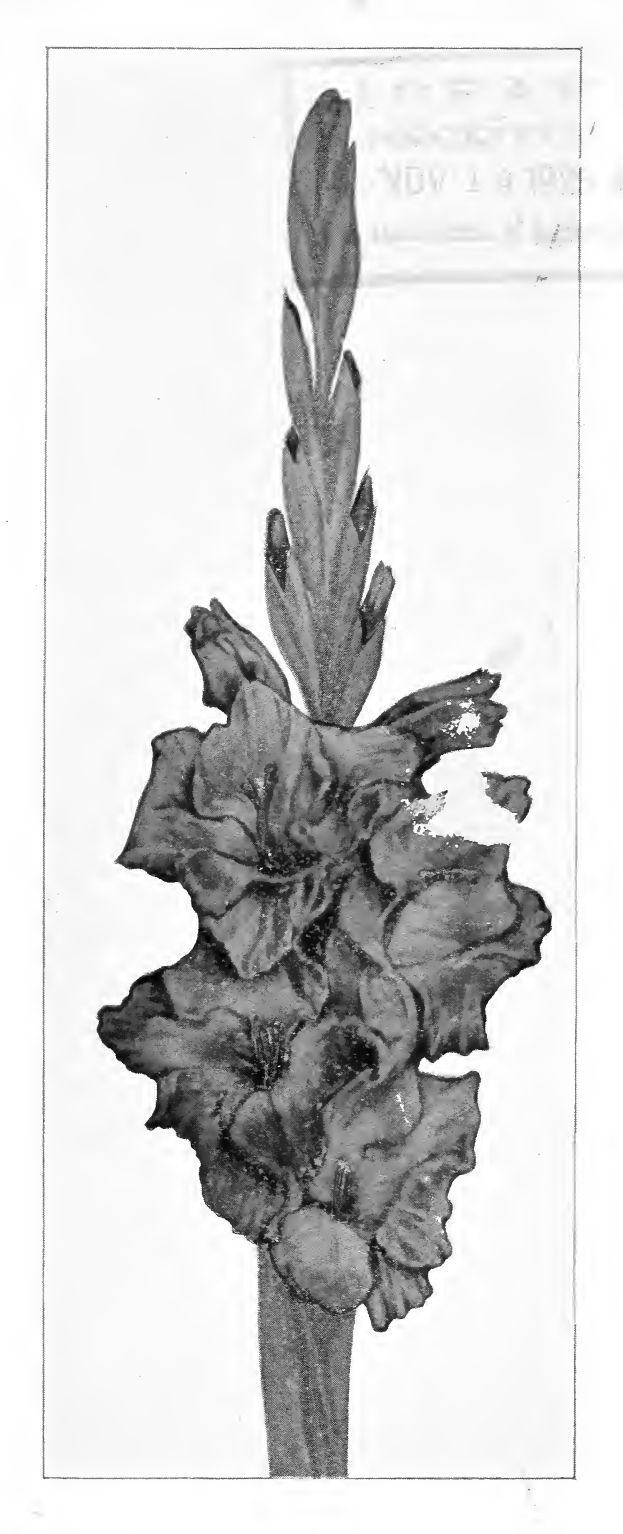
The Pierce Bulb Company Guaran-tested Gladiolus Bulbs West Medway, Massachusetts