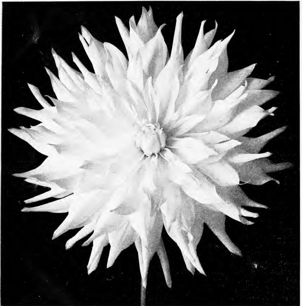
Cactus Dahlia—Rollo Boy Prize Winner (see page 9)