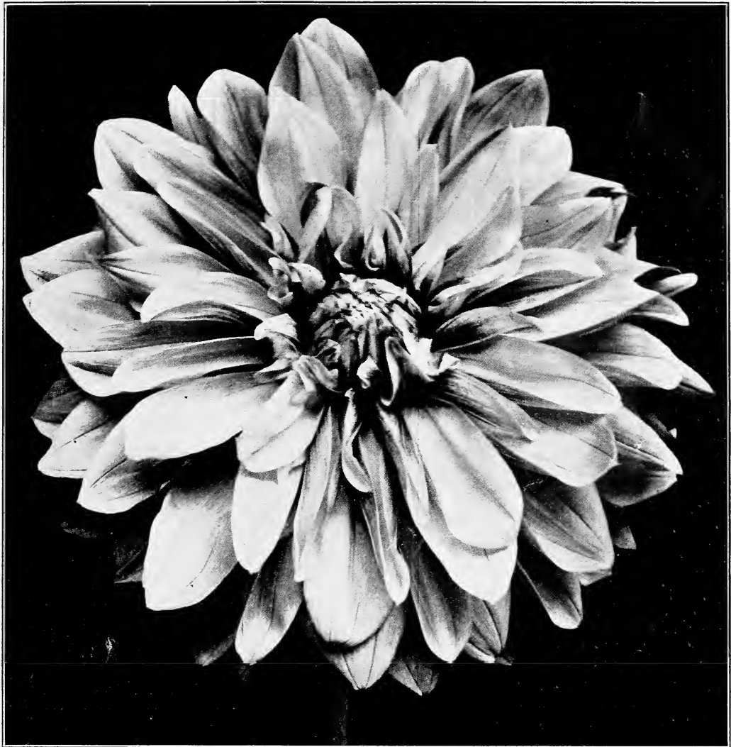
Decorative Dahlia—Dr. Tevis (see page 5)