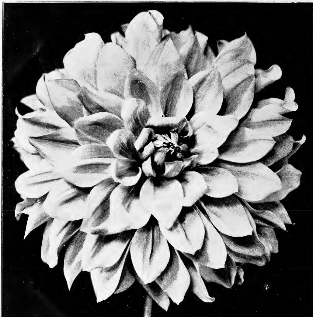
Decorative Dahlia—Millie Rodgers (see page 6)