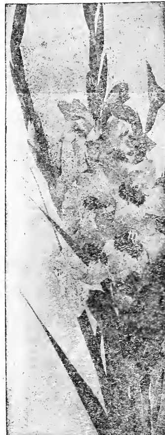
Salzer's Choice Gladioli

One Crimson Rambler Rose, one Dorothy Perkins Rose, and one Kriemhilde Dahlia. The Crimson Rambler Rose bears double, deep crimson, fragrant flowers, and like the Dorothy Perkins, is easily grown. Kriemhilde is a choice Cactus Dahlia, shell-pink, shading to white in the center. If you send us an order for $7.50 within 15 days from date, we will send you this gift, free.