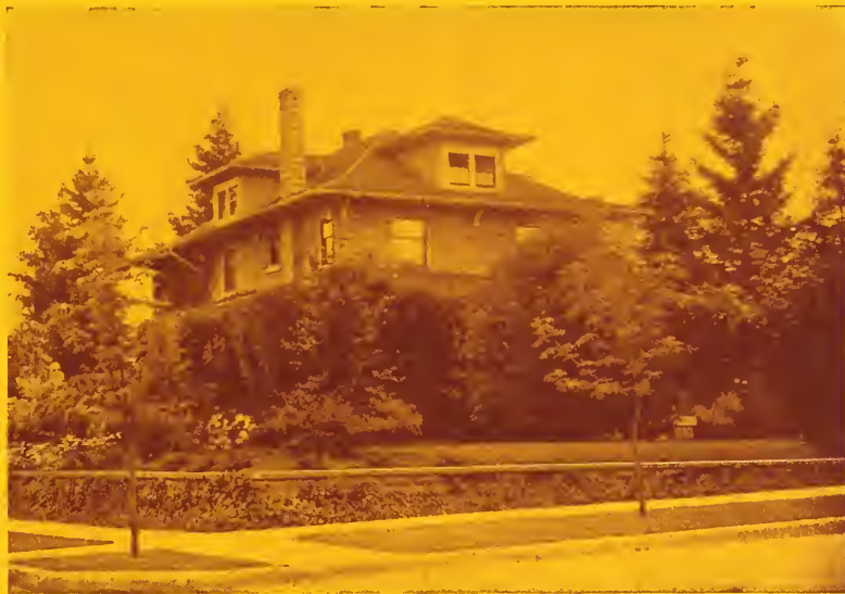
HOME OF THE MASTICK DAHLIAS

are distinctly original and famous for their wondrous beauty of form and coloring