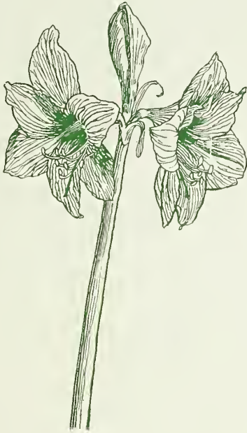
Hybrid California Amaryllis

W E believe these to be the most gorgeous flowers that can be forced in the home. Flowers of flaming red, orange, pink and striped, seven to nine inches across are borne on stalks fifteen to twenty-four inches tall. These flower stalks spring from the bulbs before a leaf appears; they are sometimes slow in starting but when growth does start it is very rapid, being from one to two inches a day. Two, three or four flowers are borne on each stalk and these are truly beautiful.