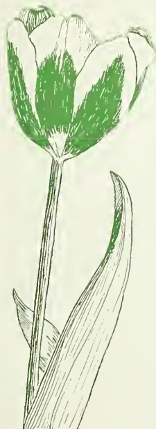
Single Early Tulips

T HE double tulips while not as brilliantly colored, come into bloom later and last longer than the single varieties. Most of the sorts that we list here may be forced in pots.