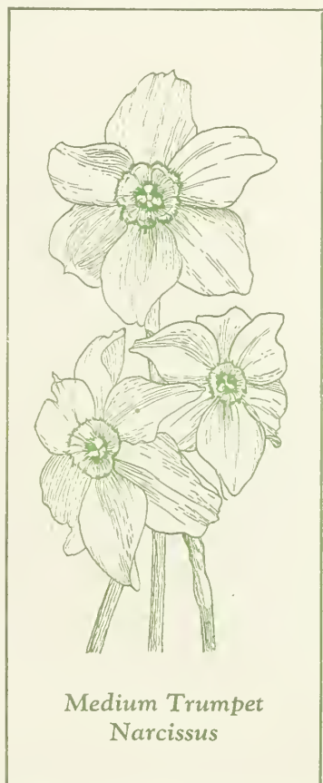
Medium Trumpet Narcissus