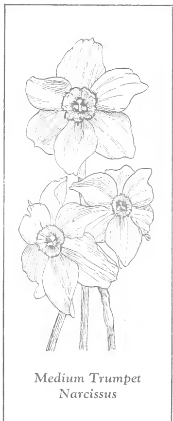
Medium Trumpet Narcissus