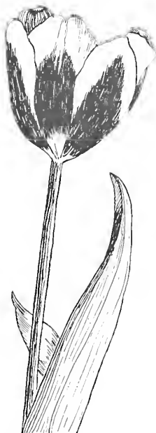
Single Early Tulips

T HE double tulips while not as brilliantly colored, come into bloom later and last longer than the single varieties. Most of the sorts that we list here may be forced in pots.