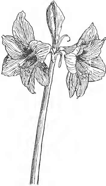
Hybrid California Amaryllis

W E believe these to be the most gorgeous flowers that can be forced in the home. Flowers of flaming red, orange, pink and striped, seven to nine inches across are borne on stalks fifteen to twenty-four inches tall. These flower stalks spring from the bulbs before a leaf appears; they are sometimes slow in starting but when growth does start it is very rapid, being from one to two inches a day. Two, three or four flowers are borne on each stalk and these are truly beautiful.