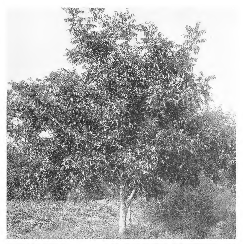
A PECAN TREE WELL INTO THE PROFITABLE STAGE They become more valuable every year