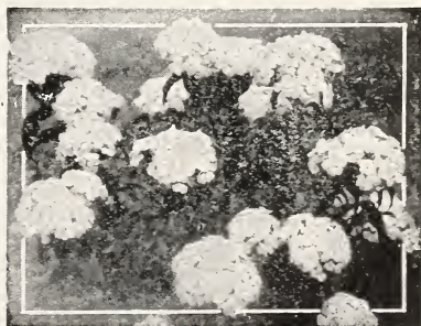
Sweet Williams (See Page 12)

Special Collection F —Assorted, our selection: Half dozen, three varieties, 70c; one dozen, six varieties, $1.25; 25, 6 varieties, $2.25; 100, 6 varieties, $7.50.