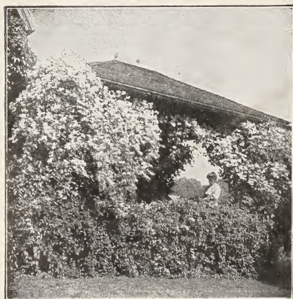
The fragrance of Clematis paniculata resembles English Hawthorn.

T HESE vines are outdoor grown and not to be confused with the small plants sold at low prices. Five of a kind at the 10 rate, less than five at the each rate.