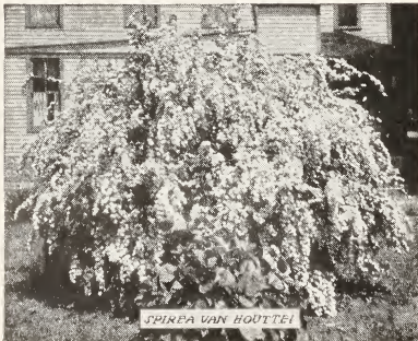
SPIRAEA VAN HOUTTEI

Weigela, Rose-colored —Trumpet shaped flowers, rose tinted white, clustered thickly along the branches in late May or early June. 18 to 24 inches.....35c each, $3.00 per 10 2 to 3 feet.....50c each, 4.00 per 10