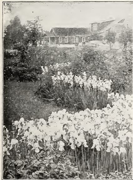
Liberty Iris are easily grown.

Can you, or anyone else, give one solid and sound reason why any man who lives on a farm, large or small, should not have fruit and vegetables, fresh or canned, of his own raising, every day in the year?—Rural New Yorker.