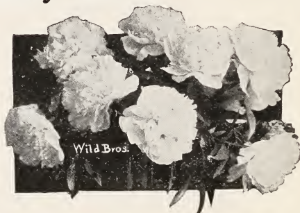
Duchesse de Nemours Peony

There are no single peonies in this list except those described as single. The name and date in parentheses is the originator and date of introduction.