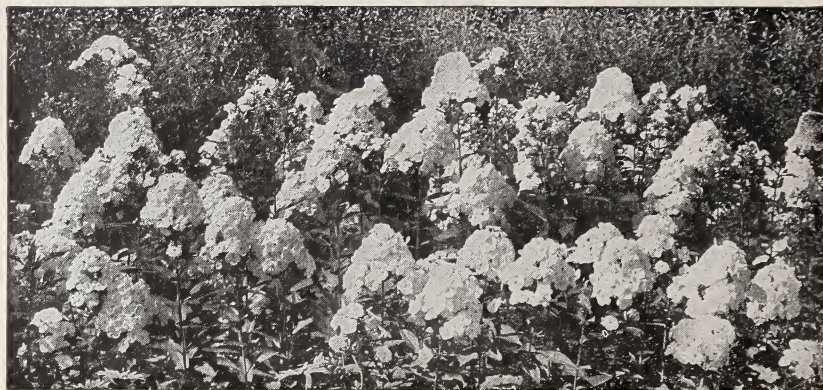
Phlox give brilliant summer effects. Strong 2 year plants, $2.00 per dozen.

T HESE are easily grown and give brilliant summer effects. Many are delightfully fragrant. They are excellent in a mixed border, but the most imposing effects are produced by planting masses of each color. Plant 18x24 inches apart.