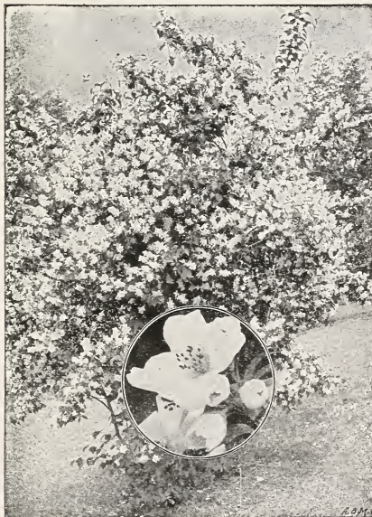
The name Mock Orange is almost a sufficient description.

Lilae, French —The French Lilacs are more dwarf in habit than the common varieties, more varied in color, and bloom younger, sometimes at two years old. Charles X—Purplish-red;