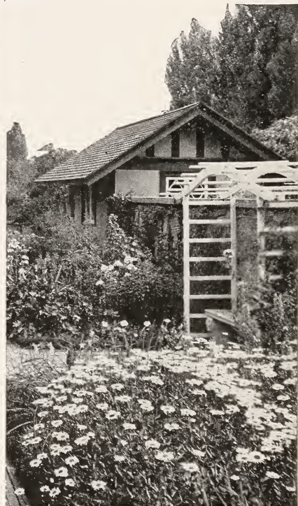
Ten weeks of Shasta Daisies.

Violets, Sweet Russian, Single —The hardest of violets; easily grown; in early spring a mass of fine single deep purple violets with delicate fragrance. 10c each, 3 for 25c, 12 for 75c, 25 for $1.50.