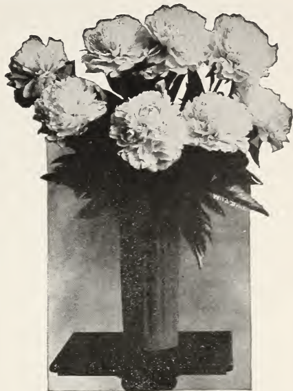
Crown of Gold Peony

Madame de Verneville (Crousse, 1885) —An enormous producer of extra fine flowers; large, compact, and very full, literally packed with petals; broad white guards, center slightly bluish becoming pure white, flecked carmine; large; bomb type; rose fragrance; very early; extra strong, vigorous growth, medium height, good stems; blooms very freely; fine. 50c each, $5.00 per doz.