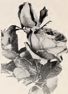
Climbing American Beauty

White Dorothy Perkins —A pure white sport of the popular Dorothy Perkins; excellent.