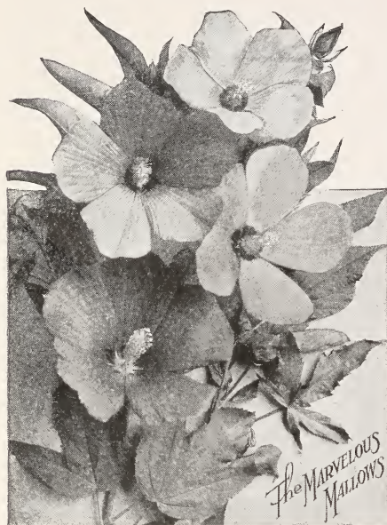
Six to Ten Weeks of Marvelous Mallows

Blanket Flower ( Gaillardia grandiflora ) —Flowers 2 to 3 in. across, maroon bordered yellow, as gaudy as a Navajo blanket; blooms from June till fall; easily grown. 15c each, $1.50 per doz.