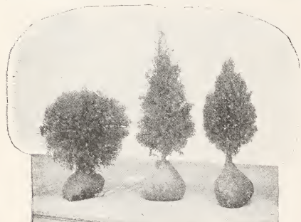
Evergreens "Balled and Burlapped."

Our evergreens have been transplanted several times, to secure an abundance of fibrous roots. At these prices the roots will be dug with a ball of earth wrapped in burlap, termed "balled and burlapped," or B. & B., except the 6 to 8 inch Boxwood. Five of a kind at the 10 rate, less at the each rate.