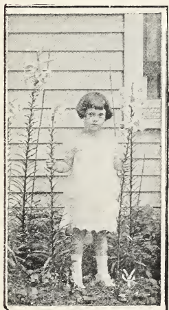
CANDIDUM—The finest hardy white lily grown.

We can furnish at a special price, bulbs for circular beds in 4 colors, varieties to be our selection. Shallow rooted plants can be grown in these beds without removing the tulips, except once in 3 years. For planting in parkways these beds are ideal. Plant the bulbs either 4 or 6 inches apart. For 3-ft. bed planted 4 in. apart, 96 tulips, 24 each, red, white, yellow and pink, $3.75 postpaid. For 3-ft. bed planted 6 in. apart, 36 tulips, 9 each, red, white, yellow and pink, $1.50 postpaid. For 4-ft. bed planted 4 in. apart, 128 tulips, 32 each, red, white, yellow and pink, $5.50 postpaid. For 4-ft. bed planted 6 in. apart, 60 tulips, 15 each, red, white, yellow and pink, $2.50 potpaid.