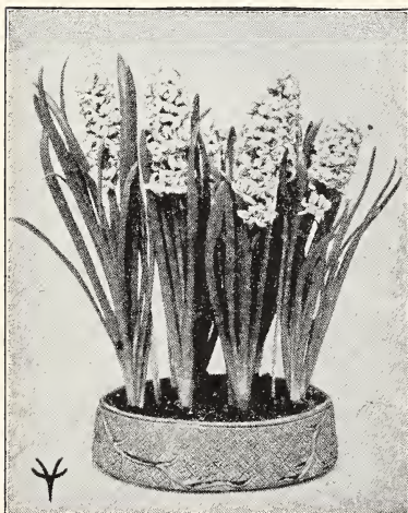
Pan of Hyacinths

Price of named Dutch Hyacinths, single and double, 18c each, $2 dozen