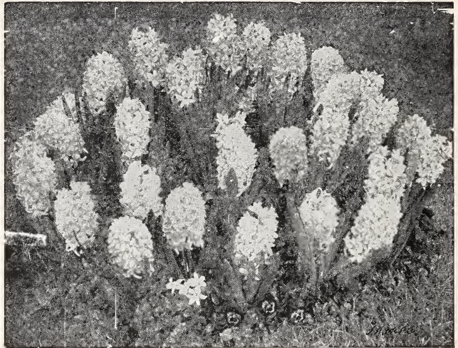
Bed of Hyacinths

(These are best for pot culture indoors) Our list contains only the best varieties for general use in their respective shades.