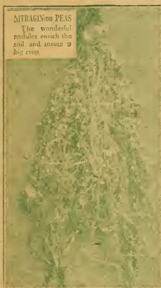
NITRAGIN on PEAS

The wonderful nodules enrich the soil and insure a big crop.