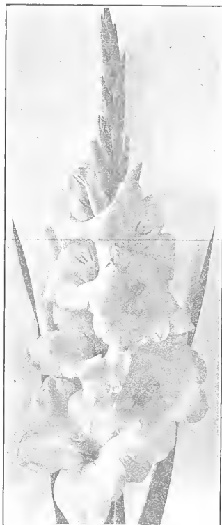
GLADIOLUS:—LE MARECHAL FOCH

E ASILY the greatest Light Pink Gladiolus ever introduced. It is not only a good propagator, but a rugged grower and sure bloomer and blooms well from small bulbs. Read what some of the experienced growers say about it, as follows: