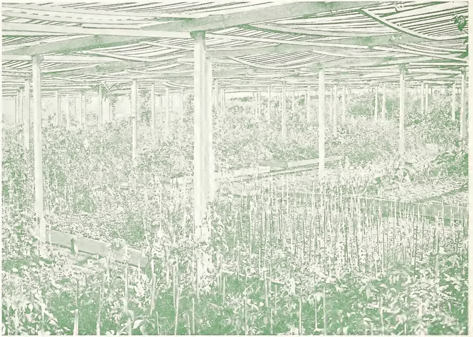
Picture showing Lath House for growing Ornamentals on our 70 acre Nursery and ranch at Morgan Hill, California.