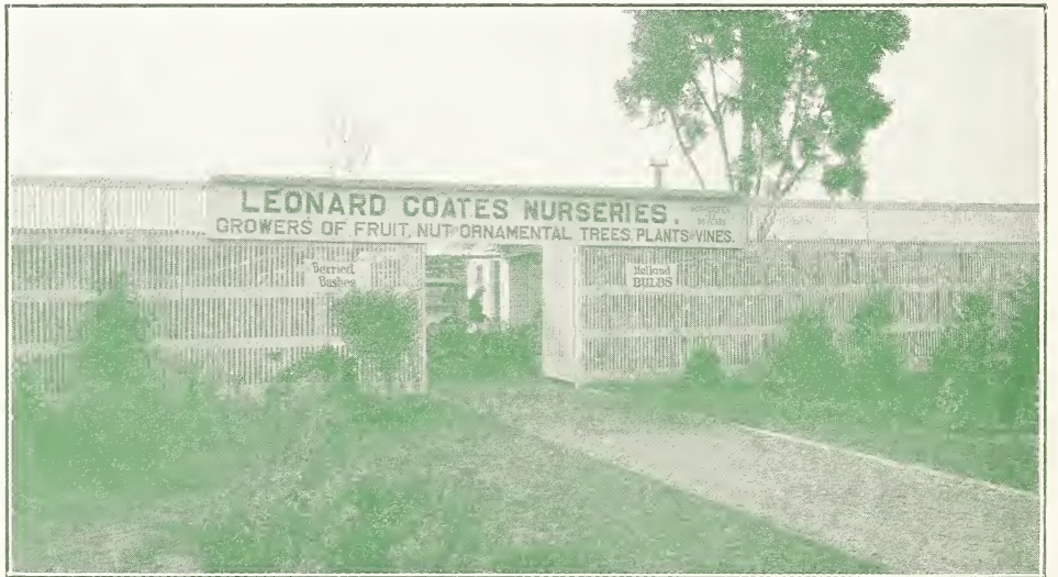
Our Lath House and Salesyard at 1835 The Alameda, San Jose, California