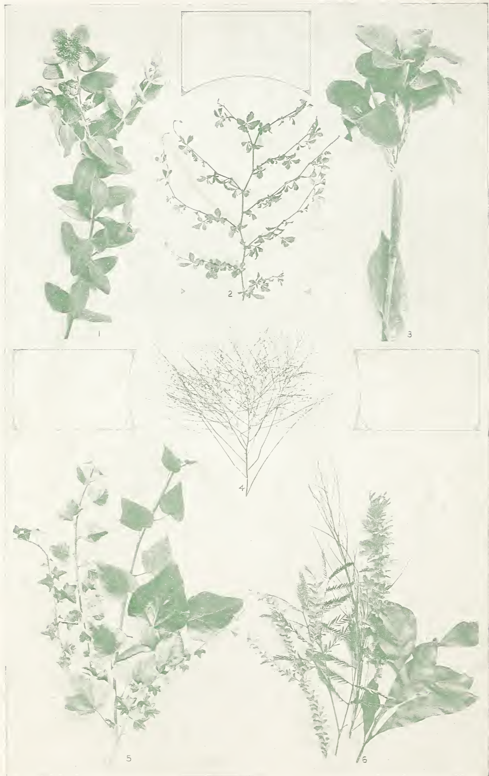
1 Hypericum Moserianum 5 English Ivies