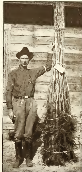
Bale of trees, 5 to 6 feet, ready to burlap

When the trees arrive, keep the roots covered until they are placed in the hole. Two men are necessary; one should hold the tree erect while the other uses the shovel. Tamp the soil firmly about the roots or pour in a bucketful of water when the hole is more than half full, to insure that there are no air-pockets about the feeder roots. Plant the tree a little deeper than it stood in the nursery.