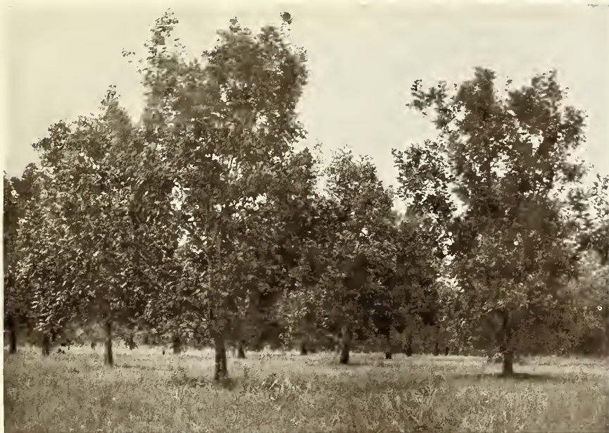
You can have one like this in 20 years if you begin now

In a comparatively few years the Pecan orchards of the southern tier states will be just as important a national asset as the citrus groves of Florida and California, or the apple orchards of the northwestern and northeastern sections. There are now growing in Alabama, Georgia, Mississippi, Louisiana, Oklahoma and Texas about 29,500,000 Pecan trees; most of these are wild ones or seedlings—Pecan sales have been built on these. Recent plantings have been of the larger, thinner-shelled varieties, such as Schley, Stuart, and Success, which are infinitely better. There are never enough of these, so prices hold steady year after year at 40 cents a pound.