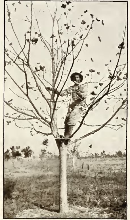
Young grove tree with profitable crop of nuts

Pecans Are Purse-Fillers for Southern Planters