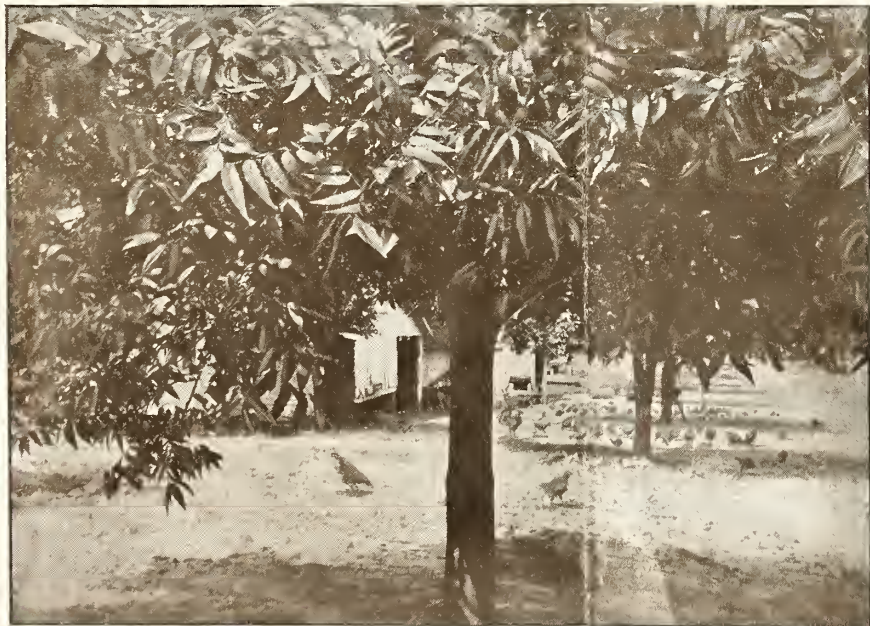
Profitable shade for the barnyard

Catch-crops are grown between the trees to pay for the cost of cultivation. A rotation of corn, cotton, and cowpeas may be grown. Properly handled, these will pay for everything, so that at twelve years of age, when the Pecan orchard is on a paying basis, it will have cost you nothing. Do you know of any other investment you can make that will be handed to you for nothing?