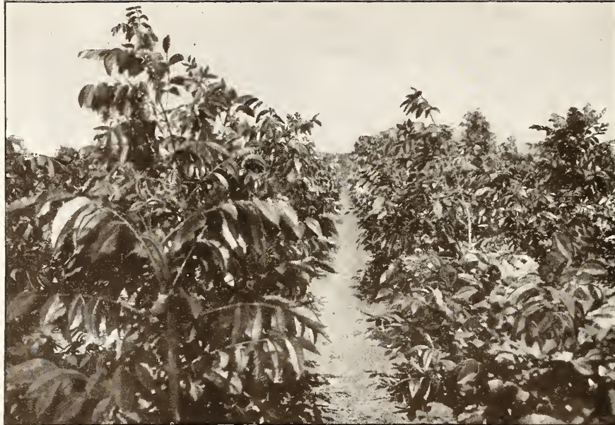
Healthy, clean and vigorous growth—no inferior stock shipped by us