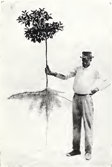
TWO-YEAR BUD AS IT GROWS IN NURSERY

at home and know just what to do. If set on rich land they will do extra well because of the excellent root system through which they take their nourishment from the soil.