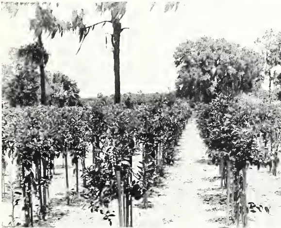
MARSH SEEDLESS GRAPEFRUIT BUDS

until late spring or early summer. After years of test, it has proven beyond doubt that it bears more regularly than any other grapefruit known. We advise all who are planting a grove for commercial purposes to plant this variety and they will make no mistake.