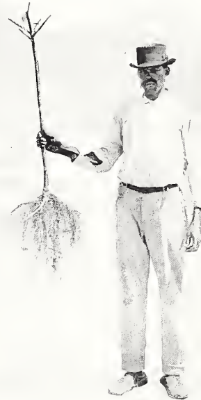
TREE TRIMMED FOR SHIPMENT

One of the most important points in a citrus tree is a good system of roots, and we have not overlooked this point in locating our nurseries. We selected light land on which to make our nurseries because of the fact that there we get a better root system. We do not push the growth of the trees by over-fertilizing, and we therefore force the tree to develop the maximum root system in order to get sufficient nourishment from the ground. By heavy fertilization we could easily obtain marketable sizes of trees in a much shorter time; but the root development would suffer and we prefer to go to the expense of taking care of the tree one year longer rather than to sell our customers trees that are not perfect in root system. Trees grown in our nursery will do well on any land that will grow citrus trees. If transplanted to light land they are