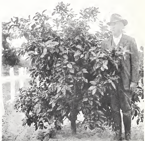
TREE THREE YEARS OLD

Anyone familiar with horticulture knows the great importance of proper