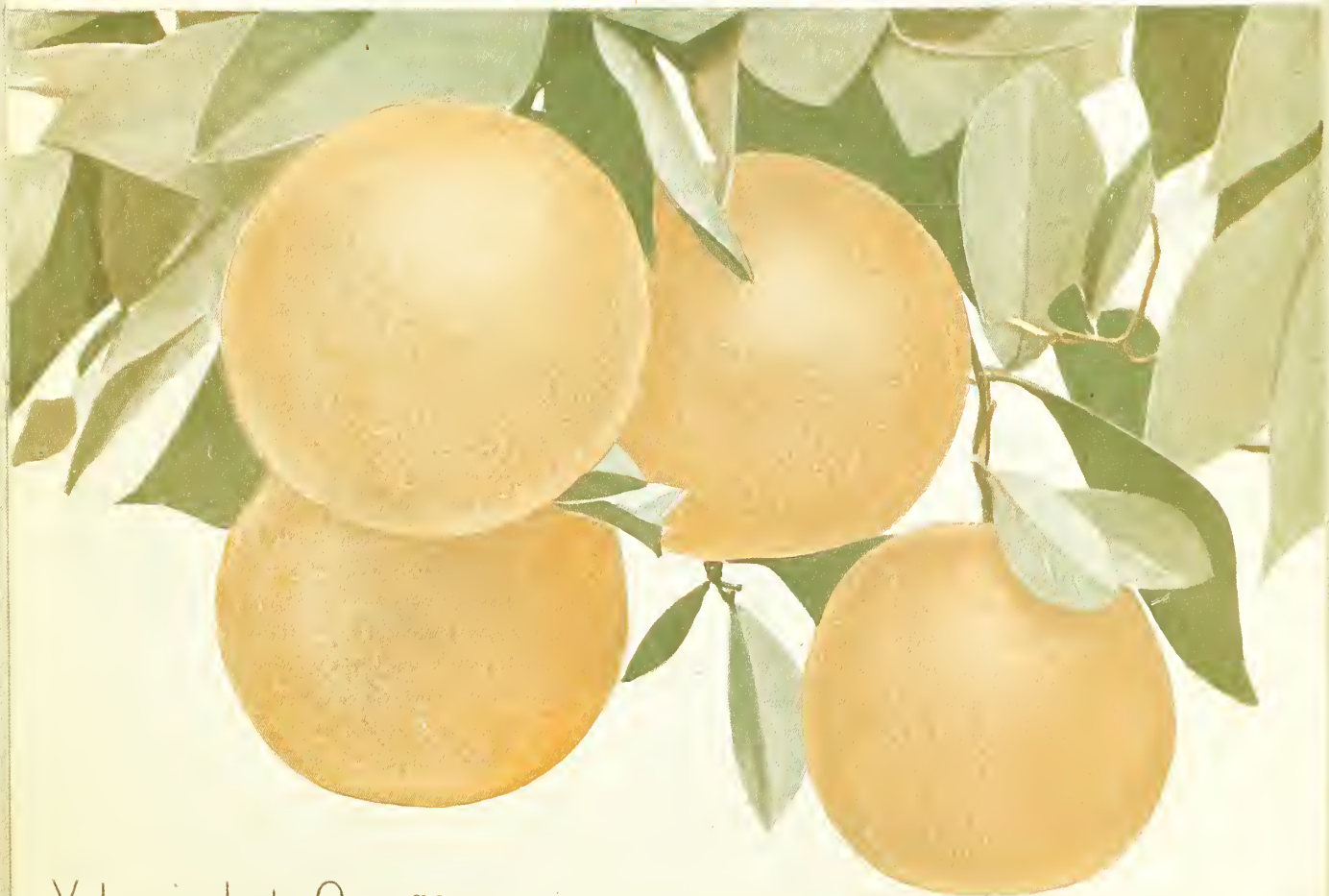
Valencia Late Orange