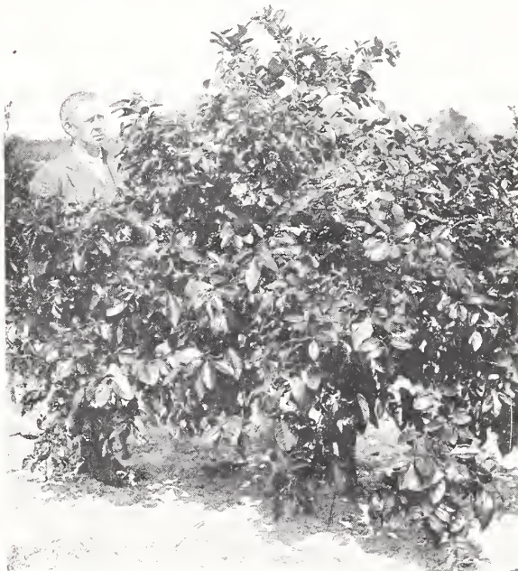
TREE FOUR YEARS OLD

Buyers of trees from our nurseries will be delightfully surprised at the