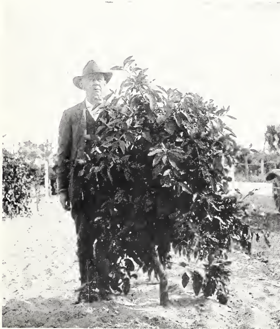
TREE TWO YEARS OLD

The Sour Orange Stock tree, we admit, is of slower growth during the first few years than the Rough Lemon Stock tree, but we consider this the best argument in favor of the Sour Orange Stock, as the slower and steadier growth has proven to be productive of trees that are much hardier not only against frost, but also against disease. Time and again it has been observed that in groves planted in mixed stock, all trees on Rough Lemon Stock had suffered severely from frost, Sour Orange Stock trees had not been touched at all. And the frequent attacks of die-back, lemon scab and similar diseases in comparatively young Rough Lemon Stock groves have very rarely been found in Sour Stock groves. Foot-rot is entirely unknown in groves planted on Sour Orange Stock. This fact has of late been very strongly brought be-