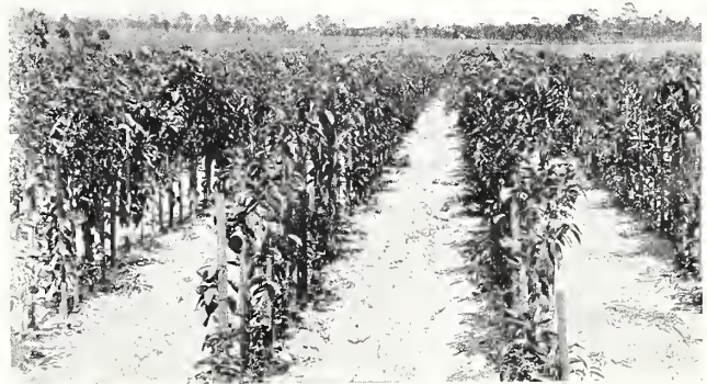
VALENCIA LATE BUDS

No other orange in Florida has become more popular with the public than the Parson Brown. It is of fine texture, excellent flavor, keeps and ships well. It begins to ripen as early as October and the crop comes on in a very uniform way. It is