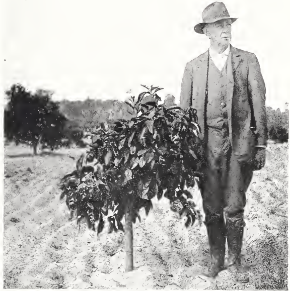
TREE ONE YEAR OLD

Orange is the native orange of Florida and its entire nature has adapted itself to the conditions of that State. Primarily this will be seen in the root system, which has the tendency of growing downward instead of spreading out six and more feet, and as a natural consequence the trees are far less subject to the suffering from long droughts which are so frequent in Florida. The deep-root system, furthermore, permits the tree to get the full benefit from the fertilizer even after the fertilizing ingredients have been washed to greater depth. This insures a more constant and even growth of the tree, while trees with a hollow and spreading root system, as such Rough Lemon Stock trees show, have a far more erratic growth, thriving immediately after fertilization but suffering as soon as the fertilizer has reached depths to which roots do not go.