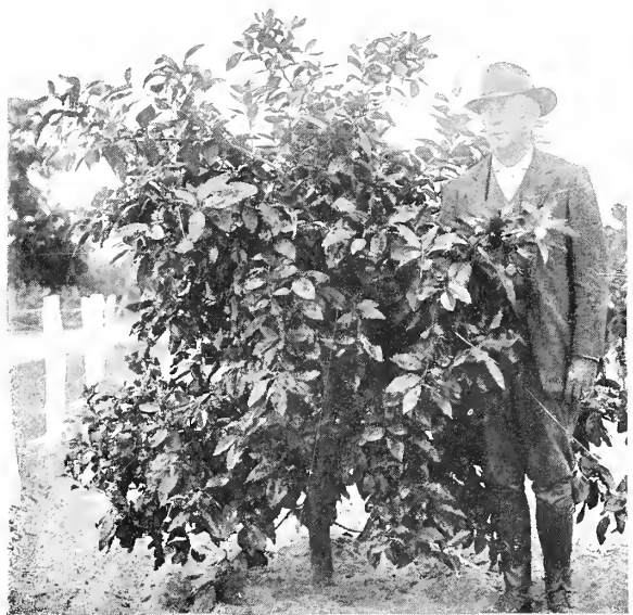
TREE THREE YEARS OLD

Anyone familiar with horticulture knows the great importance of proper