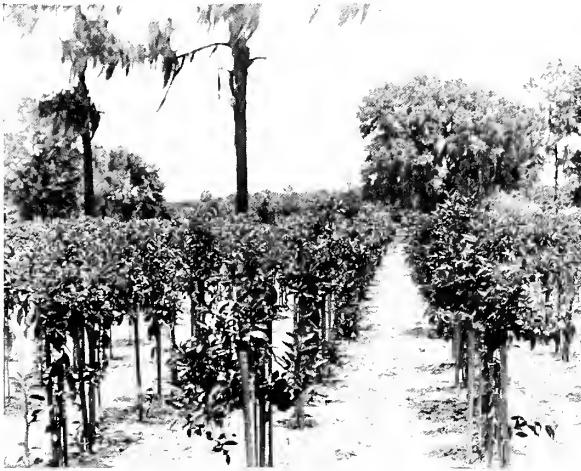
MARSH SEEDLESS GRAPEFRUIT BUDS

until late spring or early summer. After years of test, it has proven beyond doubt that it bears more regularly than any other grapefruit known. We advise all who are planting a grove for commercial purposes to plant this variety and they will make no mistake.