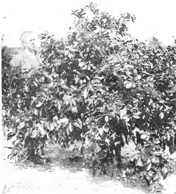
TREE FOUR YEARS OLD

Buyers of trees from our nurseries will be delightfully surprised at the