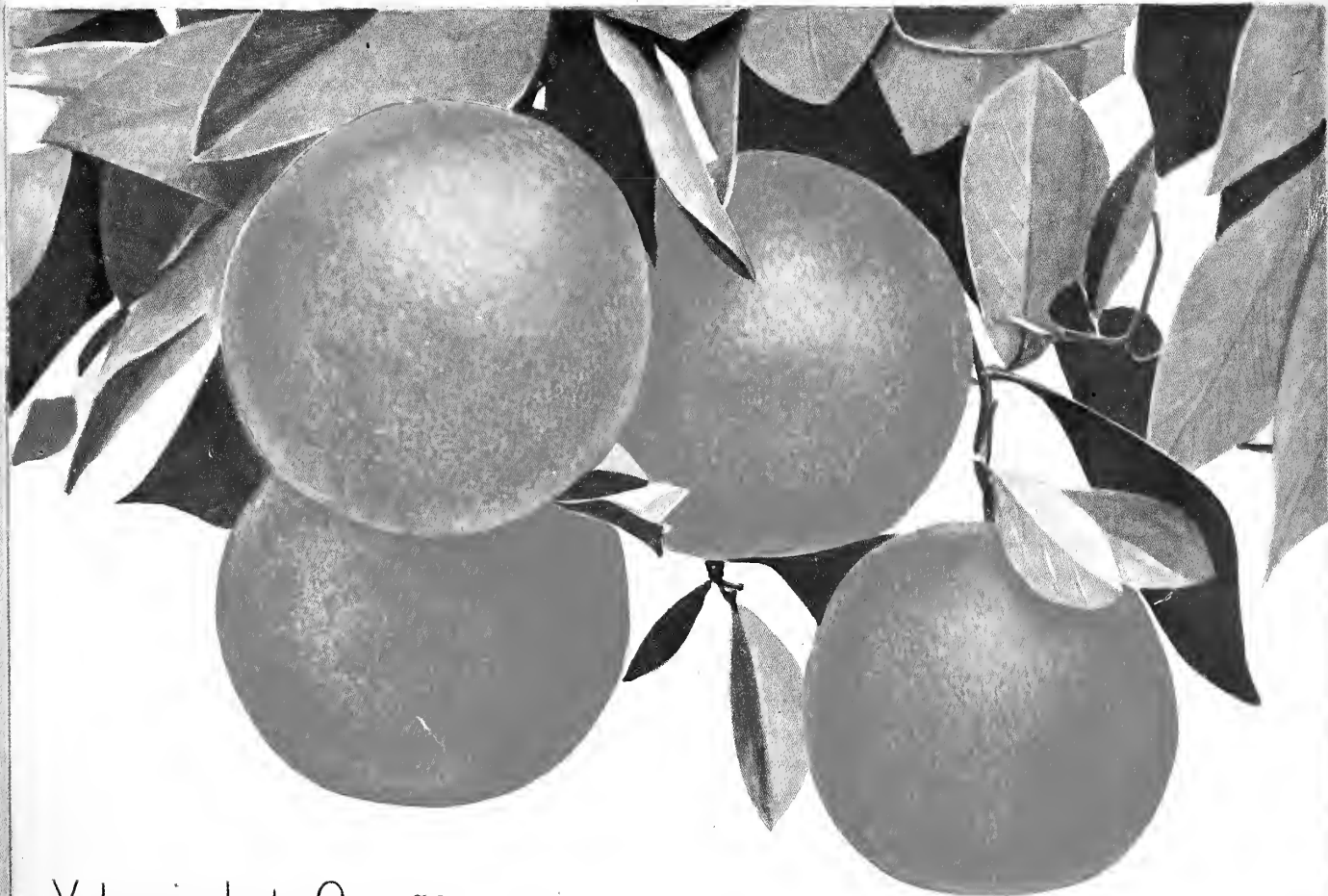
Valencia Late Orange