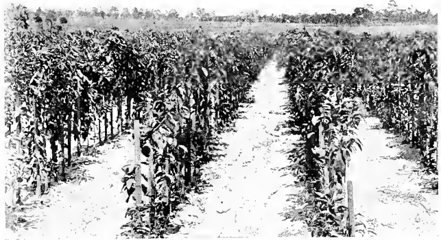
VALENCIA LATE BUDS

No other orange in Florida has become more popular with the public than the Parson Brown. It is of fine texture, excellent flavor, keeps and ships well. It begins to ripen as early as October and the crop comes on in a very uniform way. It is