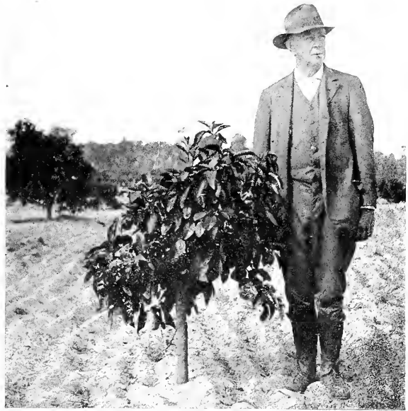
TREE ONE YEAR OLD

Orange is the native orange of Florida and its entire nature has adapted itself to the conditions of that State. Primarily this will be seen in the root system, which has the tendency of growing downward instead of spreading out six and more feet, and as a natural consequence the trees are far less subject to the suffering from long droughts which are so frequent in Florida. The deep-root system, furthermore, permits the tree to get the full benefit from the fertilizer even after the fertilizing ingredients have been washed to greater depth. This insures a more constant and even growth of the tree, while trees with a hollow and spreading root system, as such Rough Lemon Stock trees show, have a far more erratic growth, thriving immediately after fertilization but suffering as soon as the fertilizer has reached depths to which roots do not go.