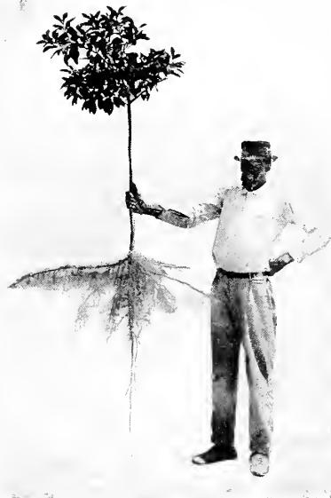
TWO-YEAR BUD AS IT GROWS IN NURSERY

at home and know just what to do. If set on rich land they will do extra well because of the excellent root system through which they take their nourishment from the soil.