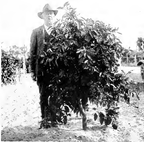
TREE TWO YEARS OLD

The Sour Orange Stock tree, we admit, is of slower growth during the first few years than the Rough Lemon Stock tree, but we consider this the best argument in favor of the Sour Orange Stock, as the slower and steadier growth has proven to be productive of trees that are much hardier not only against frost, but also against disease. Time and again it has been observed that in groves planted in mixed stock, all trees on Rough Lemon Stock had suffered severely from frost, Sour Orange Stock trees had not been touched at all. And the frequent attacks of die-back, lemon scab and similar diseases in comparatively young Rough Lemon Stock groves have very rarely been found in Sour Stock groves. Foot-rot is entirely unknown in groves planted on Sour Orange Stock. This fact has of late been very strongly brought be-