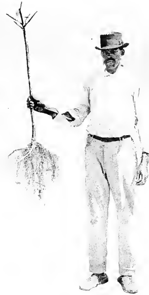
TREE TRIMMED FOR SHIPMENT

One of the most important points in a citrus tree is a good system of roots, and we have not overlooked this point in locating our nurseries. We selected light land on which to make our nurseries because of the fact that there we get a better root system. We do not push the growth of the trees by over-fertilizing, and we therefore force the tree to develop the maximum root system in order to get sufficient nourishment from the ground. By heavy fertilization we could easily obtain marketable sizes of trees in a much shorter time; but the root development would suffer and we prefer to go to the expense of taking care of the tree one year longer rather than to sell our customers trees that are not perfect in root system. Trees grown in our nursery will do well on any land that will grow citrus trees. If transplanted to light land they are