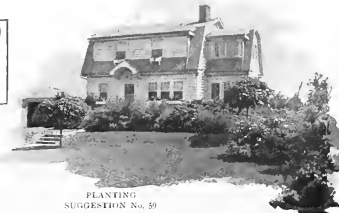
PLANTING SUGGESTION No. 59