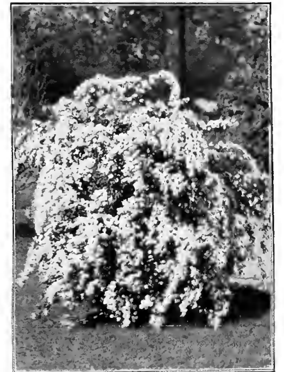
SPIRAEA VAN HOUTTEI