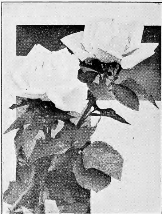
Frau Karl Druschki Rose.

I have for sale a surplus lot of EVERGREEN AND DECIDUOUS TREES CHINESE AND SOUTHERN MAGNOLIAS RHODODENDRON AND AZALEAS SHRUBS AND PERENNIALS DWARF BOXWOOD